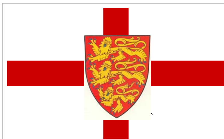
St George and Royal Coat of Arms, King Richard 1 st , Lion Heart.