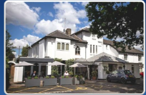
The George Hotel 10 Arlington Lane Newmarket Road Norwich NR2 2DA

Vegetarian and gluten free options are available.