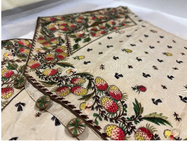
Silk waistcoat, late 18 th century

While the majority of the collections are off-site, Ruth has been concentrating on improving documentation by adding images to the database and generating online content for the website, based on the Textile Treasures exhibition in 2021, working with a new volunteer and with a UEA Cultural Heritage Placement student.