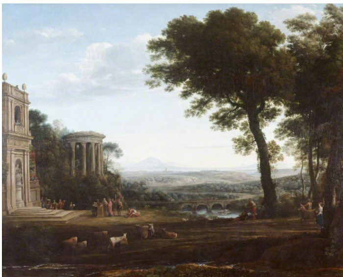
Claude Lorrain, The Father of Psyche , 1663, National Trust, Anglesey Abbey