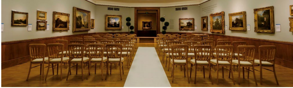
The Colman Gallery wedding space