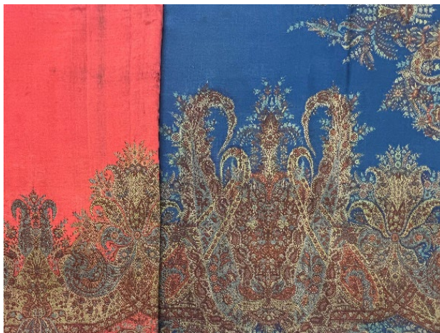
Norwich Shawl, 1869