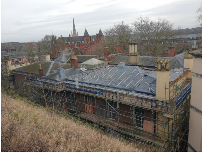
The Courtroom roof under repair