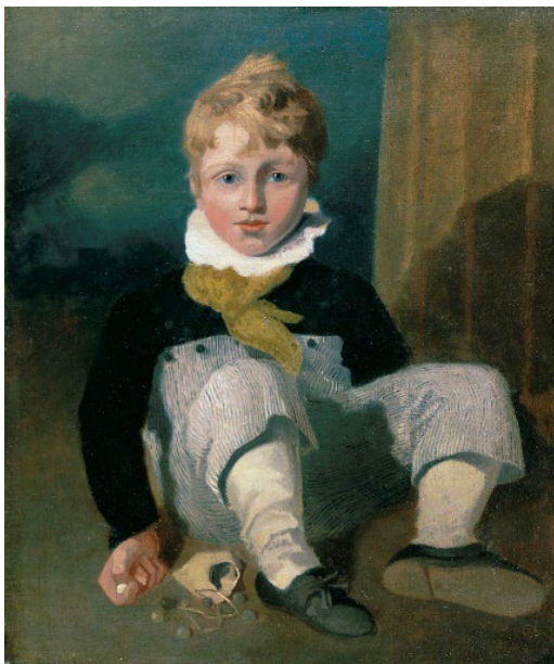
Boy at Marbles , John Sell Cotman, 1808