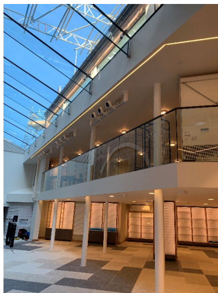
New entrance atrium showing glazed roof (L), ticketing desk, shop and café levels (R)

A verbal update on recent progress will be provided at the meeting.