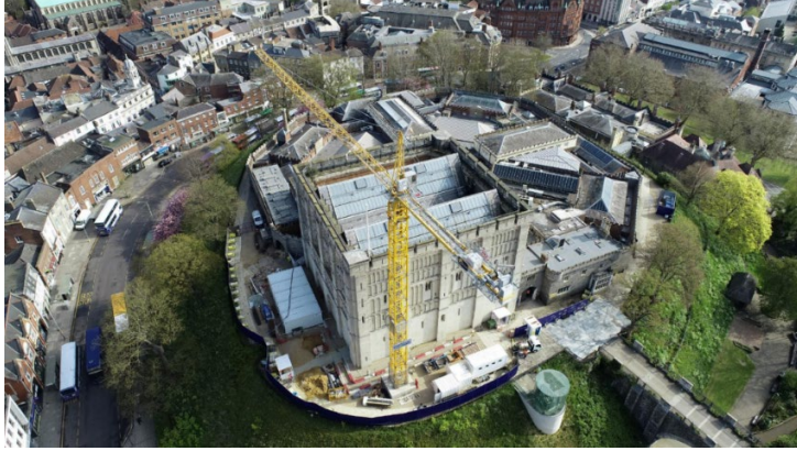
Drone image of the construction site

Sectional completion of the first phase of the project took place on 11 August 2022, with the formal handover of the new WC block area, which includes accessible toilets, baby changing facilities, a new Changing Place and a 'pop-up' catering facility. The Changing Place is now fully operational and registered https://www.changing-places.org/find?toilet=2026 .