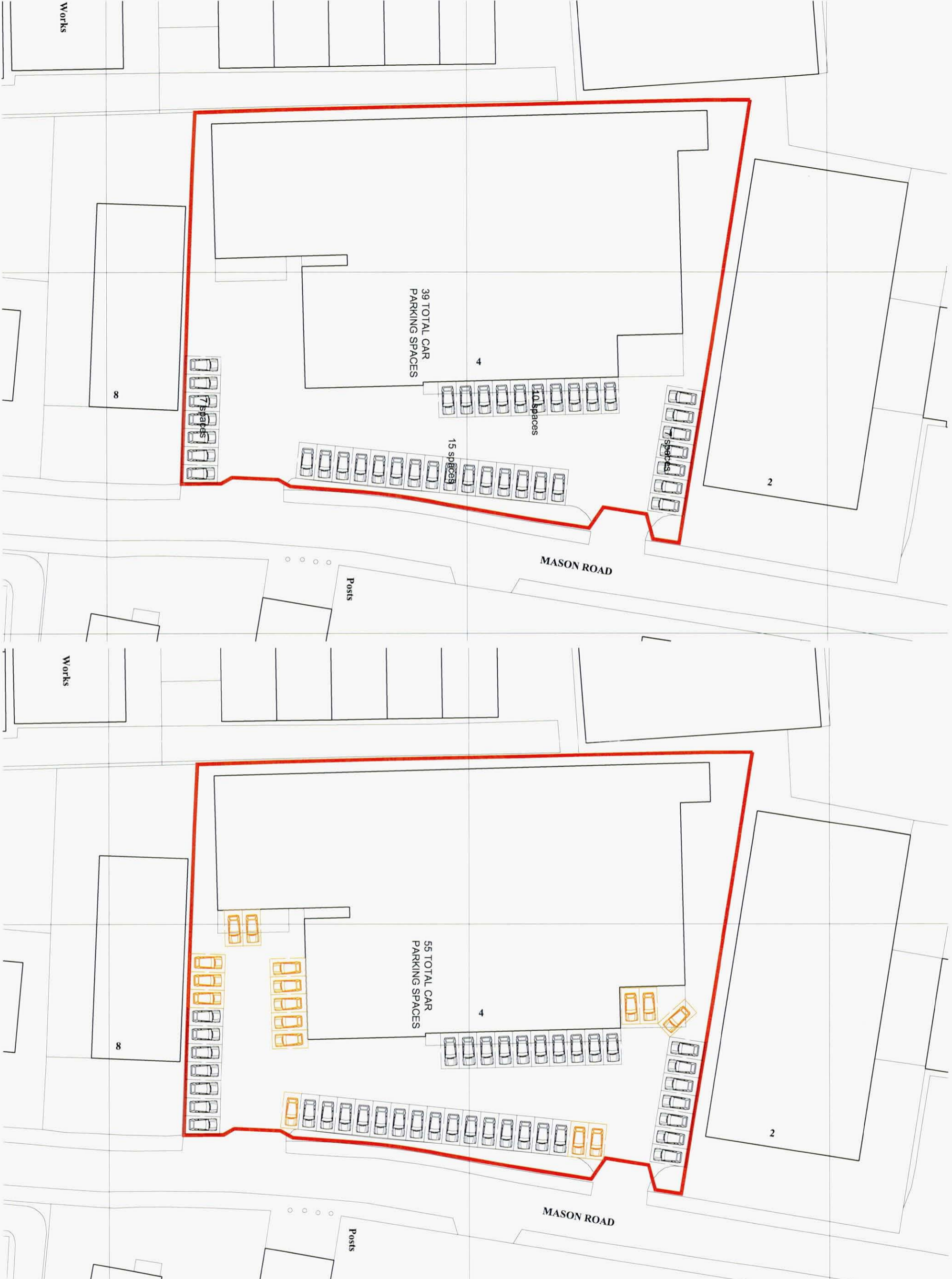
SITE PLAN - EXISTING 1:500