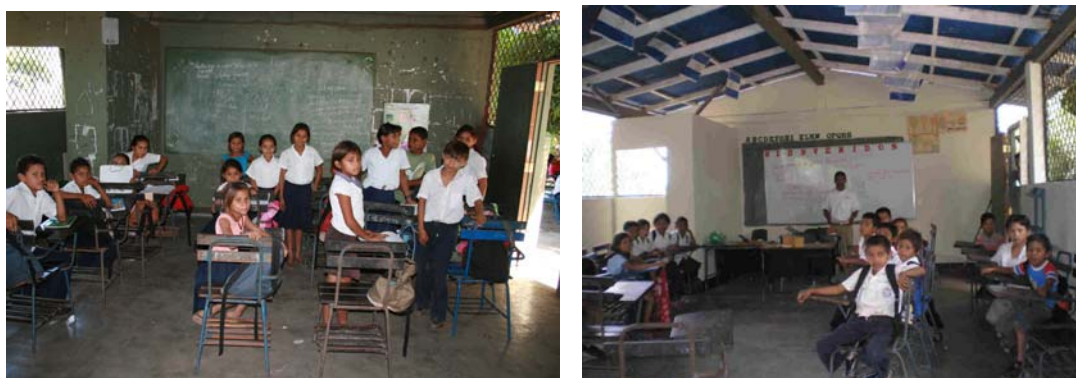
El Recreo School – before and after internal; decoration

A visit to the small school of El Recreo took place to inspect the results of internal redecoration that had been funded by the Link. This had resulted in a significant improvement to the school which now presented a much more attractive environment for the children than its previous drab and depressing condition.