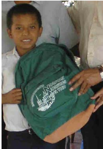
Schoolbags given to each scholarship pupil now carry the Link logo

Much is due to the dedication of the teachers who workresources to assist them. The Link Committee sent a letter of thanks to all the teachers involved in the scheme, and particularly to those who serve on the local committee. They certainly are deserving of our thanks. Many of the teachers live considerable distances from the rural schools some of which are very isolated. They depend to a large extent on the informal travel service of lifts given in the ubiquitous Toyota pick-ups which travel the area. They also have to walk long distances to reach some of the schools either in the heat and dust of the dry season or the rain and mud of the rainy months.