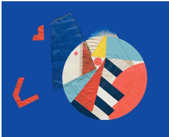
Louis Hudson Untitled Porthole 1

diversity of the region's creative talents in this popular show. All works in this show are available for sale.