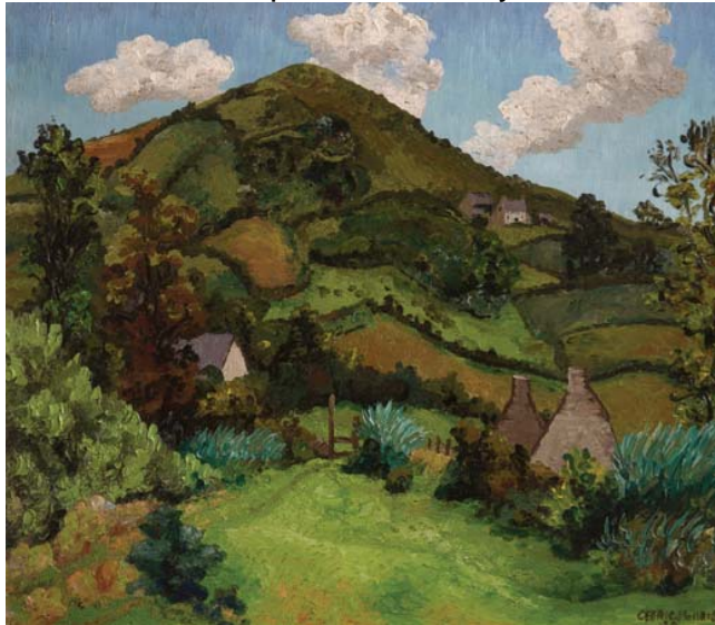
Cedric Morris, Harding Down, Llangynwyd, Bridgend, 1928. Gallery Oldham.

This autumn Norwich Castle hosts the first exhibition devoted to the British artists Cedric Morris (1889-1982) and Christopher Wood (1901-30) focussing on their friendship and the many artistic links between them