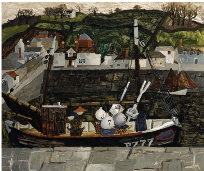
Christopher Wood, Newlyn, 1930.