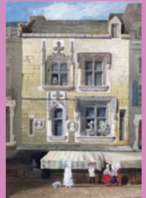
John Sell Cotman, Old house in the Rue St Jean at Caen, pencil and watercolour.

Norwich Union and Bernard Matthews Galleries