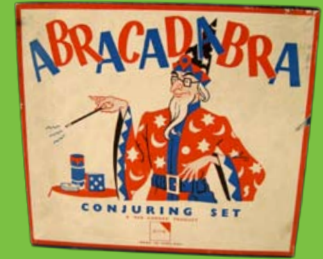
Abacadabra Conjuring Set, Suprex, England 1955-1965