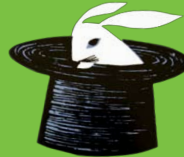
A Pretty Kettle of Tricks, promotional advertising story book for Colman's Mustard, England 1950s.