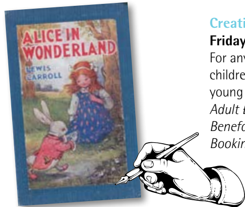
Alice in Wonderland by Lewis Carroll, Everett and Co Ltd, circa 1912.