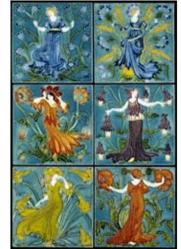
Group of six ceramic tiles showing The Flower Fairies , designed by Walter Crane, possibly for Pilkington & Co. Ltd, England c.1900.