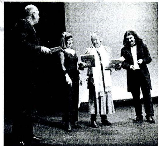
Presentation to the Artists at the end of the concert by The Lord Mayor and the Chairman of the Association

Final accounting will take place but at the moment it looks as though £1,400 will have been raised for the Milan Petrović School in Novi Sad.