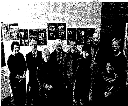
The Lord Mayor. The Chairman and the Director and members of the E.H.O.