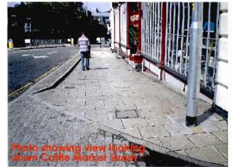
Photo showing view looking down Cattle Market Street