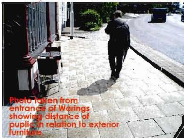
Photo taken from entrance of Waring's showing distance of public in relation to exterior furniture

UNLESS OTHERWISE SPECIFIED: FINISH DIMENSIONS ARE IN MILLIMETERS SURFACE FINISH: TOLERANCES: LINEAR: ANGULAR: