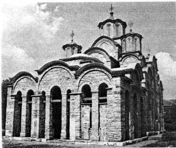
The Monastery at Gračanica