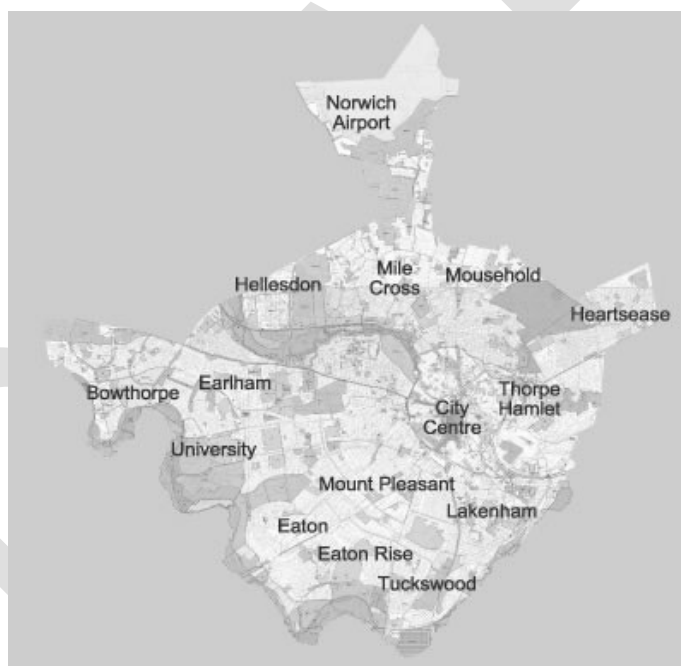
Figure 1 Map of Norwich City Council area showing the city centre and key suburbs

Norwich City Council is situated in the County of Norfolk, which contains 7 District Councils in total. The City Council area has a population of approximately 144,000 (Office for National Statistics 2021 Census) making it the second largest in the county in terms of population. In terms of area, it is the smallest in the county, covering 15 square miles (Office for National Statistics). The Council area is entirely urban. This is shown in the map attached.