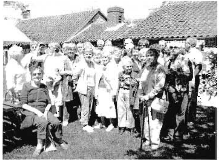
Members from Rouen and Norwich in the garden of the Lord Nelson

the round-towered church at Burham Norton. No consideration of medieval churches in Norfolk can omit reference to the round towered churches, as