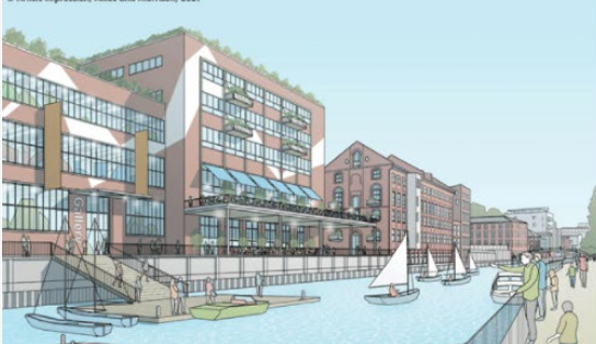
Image: Artists impression of Wensum riverfront showing how parts of the Carrow Works site might look if brought back into use, © Allies and Morrison, 2021

© Artists impression, Allies and Morrison, 2021