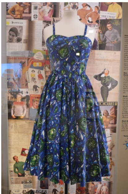
Display case of 1950's costume

The exhibition has also provided a focus for work with young people recruited through the NMS-wide Kick the Dust:Norfolk project. A group of students were recruited and given responsibility to develop one display case of 1950’s costume (shown below) and worked with NMS staff through every step of the curatorial and creative process, including selecting the objects, working on the conservation and final display of the objects and writing exhibition text and designing a graphic drop back. The artistic talents of one of the students in particular earned her three weeks further work experience over the summer holidays, assisting with a programme of drawing workshops.