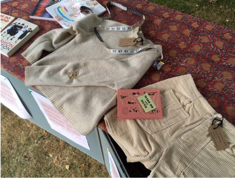
Reinvent, Reuse, Rewear workshop

Collections recently visited by specialist researchers have included the Sarah Glover collection, the Charlie Green photograph album collection, and the textiles collection, including a rare 17 th century beaded basket.