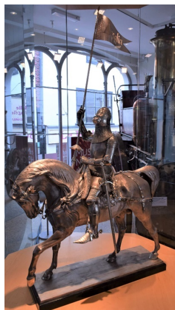
Silver knight, on loan from ITV Anglia