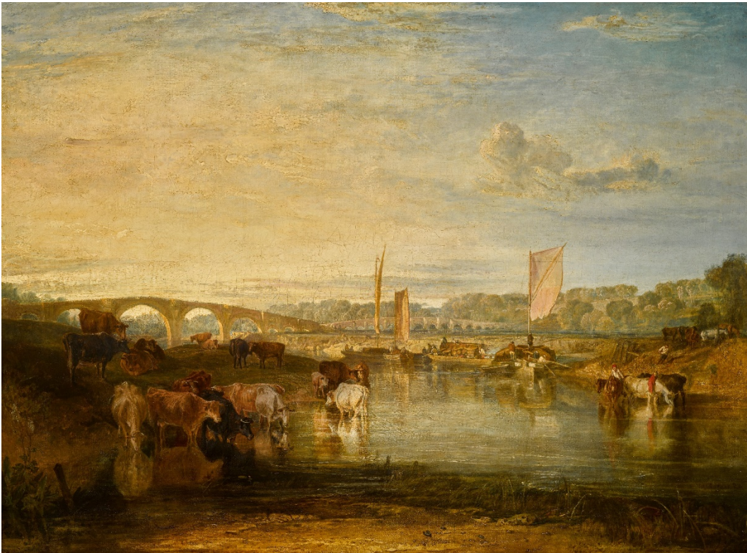
Walton Bridges JMW Turner 1806 oil on canvas

This process, unusually ambitious for a regional museum, has resulted in the successful acquisition of the first Turner oil painting to enter a public collection in Norfolk, Suffolk and Essex. This work, painted in 1806, is ideally suitable for this region. It will complement existing holdings of British landscape paintings by the Norwich School artists, including John Sell Cotman and John Crome, for whom Turner was a seminal influence. His approach, painting directly from nature, was ground-breaking at the time. His example inspired Norwich School artists who also sketched 'en plein air' to immerse themselves in the local landscape.