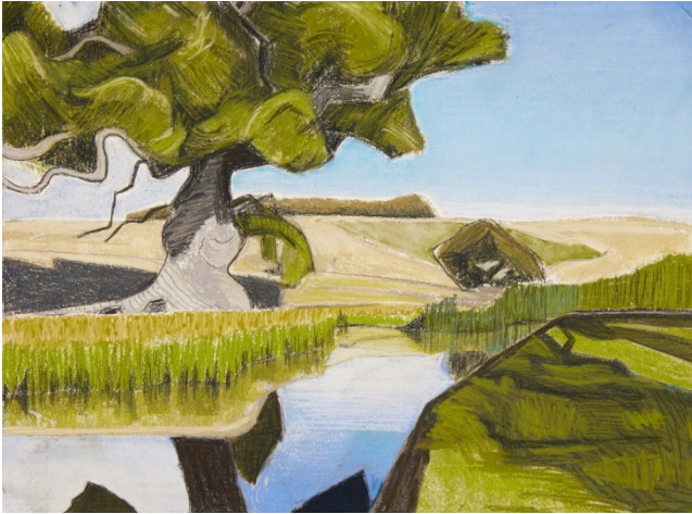
Tor Falcon Sparrow Beck at Felbrigg Pond 2018 © Courtesy the Artist

Norfolk's rivers and their tributaries are the focus of Falcon's most recent body of work. Over the last four years, Falcon has painstakingly researched and captured her subject, drawing on location within the landscape. The artist describes being captivated by the poeticism of first encountering the rivers as an alphabetical list, with 'names that read like an Old English poem of all things watery and damp.' The result is an exceptional series of drawings that powerfully evokes this unique county. A second hang of Falcon's work opens in October 2019.