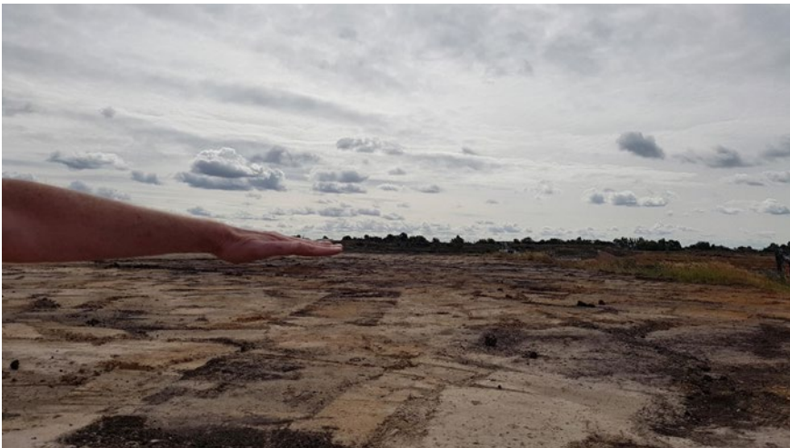
Must Farm

Wilson's work has been commissioned as part of New Geographies , a three-year project which aims to create a new map of the East of England based on unexplored or overlooked places. As part of the project, the public was invited to nominate unexpected places in the region that they found meaningful and interesting. Over 270 sites were identified and ten artists were commissioned to highlight some of those places through new site-specific work. Wilson responds to the nominated site 'View from the North Brink across the Fens' from which Must Farm is visible.