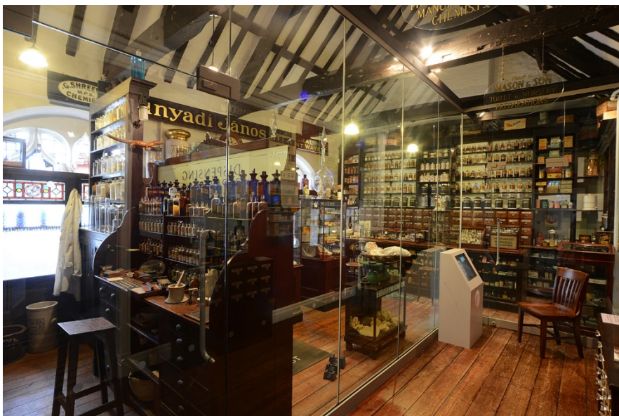
The pharmacy at the Museum of Norwich