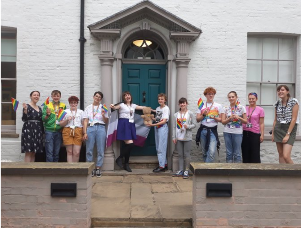
Members of Ancient House Teenage History Club at the Museum of Norwich

Following the capacity crowd tour, the group then took their places in the Pride march.