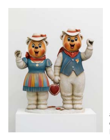
Image credit: Jeff Koons, Winter Bears, 1988 ARTIST ROOMS Tate and National Galleries of Scotland. Acquired jointly through The d'Offay Donation with assistance from the National Heritage Memorial Fund and the Art Fund 2008