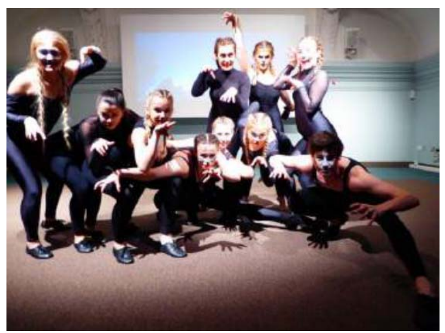
City College dancers recreating Cats