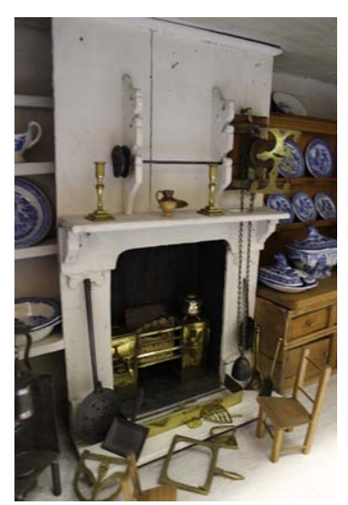
Norwich Baby House kitchen detail

The Museum closes on 23 December for its annual deep clean in which curatorial and conservation staff work with a large team of volunteers to tackle the large-scale collections care programme that is required by an historic house museum: ceiling to floor cleaning, conservation cleaning of small objects, vacuuming and freezing of textiles. Annual building maintenance work is also taking place involving the repairs of leaks to ceilings in several areas of the building.