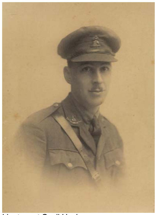
Lieutenant Cecil Upcher

Mousehold Heath. The cottages were designed by Cecil Upcher who served in the Royal Norfolk Regiment in the First World War. He was shot and wounded and suffered terribly from shell shock. After the war, he returned to his architectural practise in the city and designed the cottages for disabled servicemen and their families. NMS holds a collection of his letters and drawings which are on display at the Royal Norfolk Regimental Museum in the Castle. The exhibition running alongside this is the result of a community-based project run by Norwich HEART. Volunteers with HEART researched the lives of Colman's workers during the First World War, and the response the company had to the War, and the impact it had on the lives of its employees. The 'Colman's Detectives' used NMS archives, as well as getting access to the Unilever archive collection to put the exhibition together. Originally on display at the Forum, it will be at the Museum of Norwich until 5 March.