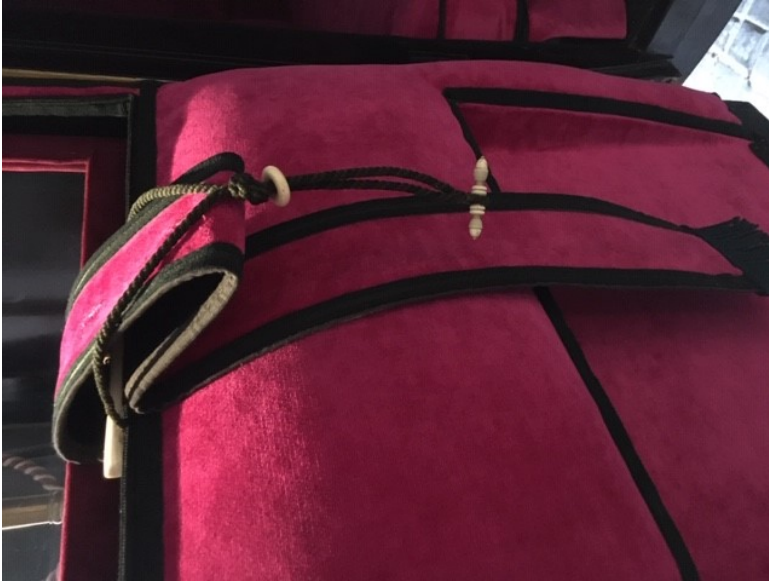
Detail of new upholstery in the Lord Mayors coach