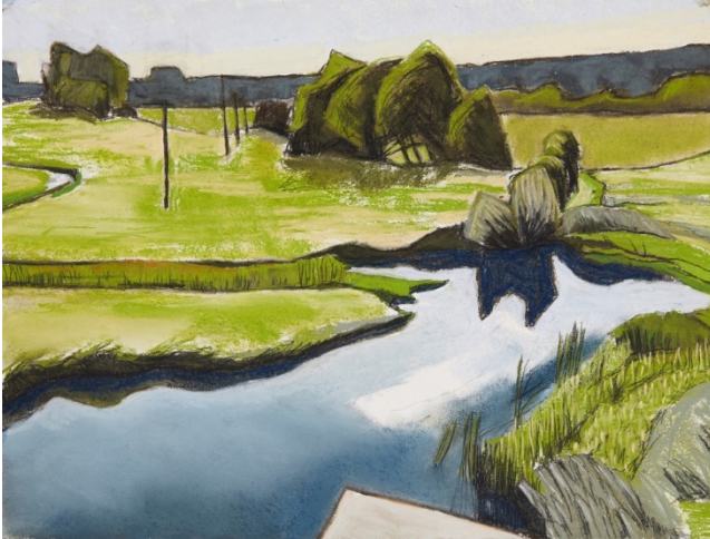
Tor Falcon The Wensum at Attlebridge © Courtesy the Artist