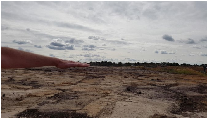
Must Farm © Courtesy the Artist

Wilson's work has been commissioned as part of New Geographies , a three-year project which aims to create a new map of the East of England based on unexplored or overlooked places. For this project, the public was invited to nominate unexpected places in the region that they found meaningful and interesting. Over 270 sites were identified and ten artists commissioned to highlight some of those places through new site-specific work. Wilson responds to the nominated site 'View from the North Brink across the Fens' from which Must Farm is visible.