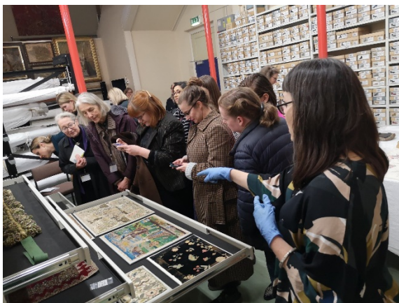
Conference delegates visiting the stores