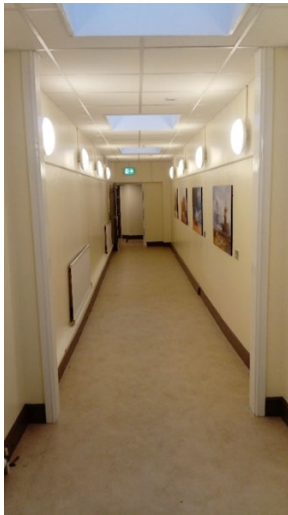
The new permanent wedding guest entrance corridor

Going forwards the Wider Impact Group will be looking at the operational and facilities management associated with the new-look museum. It will also concentrate on the visitor journey and ensuring the visitors to the museum will have the very best visitor experience.