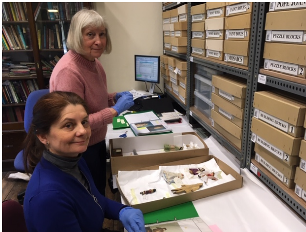
Volunteers assessing collections at Strangers' Hall

To inform the celebration of the forthcoming centenary of Strangers' Hall as a City of Norwich Museum, a preliminary assessment of archive material relating to the history of Strangers' Hall is underway. This includes a wide range of manuscript and printed documents, photographs, museum records, old guidebooks and Bolingbroke Collection items. Together these give a fascinating insight into not only the history of the building and its restoration, but also the establishment of the first social history museum in the country, alongside the outlook and aspirations of early curators and collectors. Over the next months the documentation of this collection will be upgraded, with an intern from the UEA MA in Cultural History and Museology helping prepare the way for celebratory displays in the museum's centenary year, 2022 – 23.