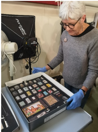
Volunteers preparing collections for tours

Volunteers have been developing a tour of the stores for the public events programme. They successfully delivered a pilot in October which received very positive reviews, with the next tour planned for Saturday 29 February. Four volunteers have each worked on a script for a store - womenswear, handling collections, library and archive collection and the large main store with information about collecting, documentation, collections care and access to collections. The volunteers have chosen a few key objects to show to the groups.