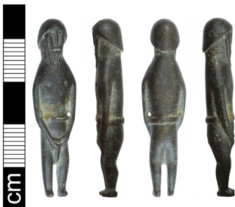
Anglo-Saxon votive figurine