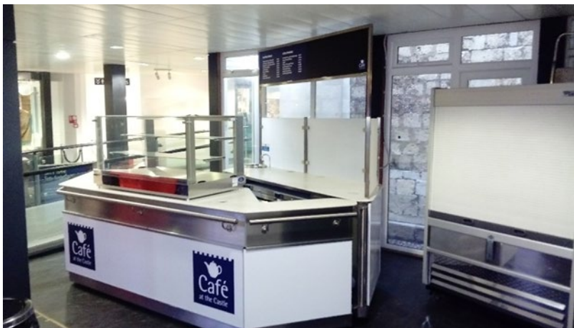
The temporary 'pop up' catering unit located in the Rotunda