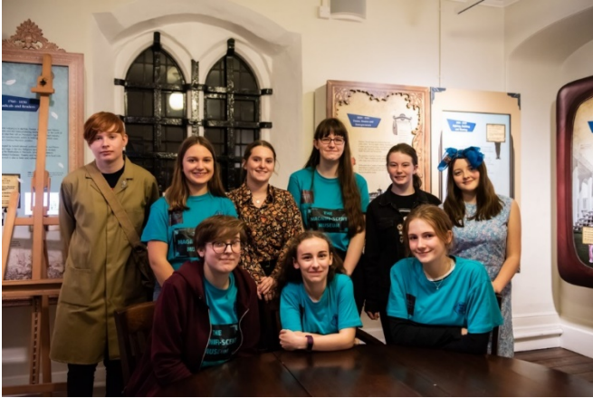
The Kick the Dust team

The team, all aged 15 to 17, rose to the occasion and devised a series of 'smell stations' bringing the history of Norwich to life. These included a sniff and tell session about the development of Coffee Houses in Georgian Norwich, taste tests of chocolate and nostalgic tales of Caley's and Mackintoshes, and an invitation to discover medicines in the past through the sense of smell in the pharmacy.