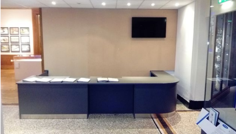
The new temporary ticket desk located in the Decorative Arts Gallery