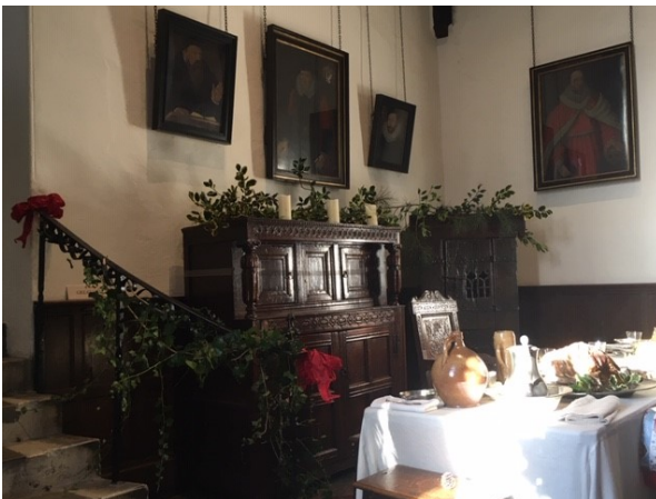
Christmas decorations at Strangers' Hall