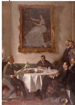
Sir William Orpen, Homage to Manet, 1909, oil on canvas

The exhibition will include a number of loans from Tate, the British Museum, The Manchester City Art Gallery, the Royal Academy and private collections including work by Claude Monet, John Singer Sargent, Walter Sickert, and Philip Wilson Steer, Gwen John, William Orpen, Vanessa Bell, Laura Knight, Alfred Munnings and others.