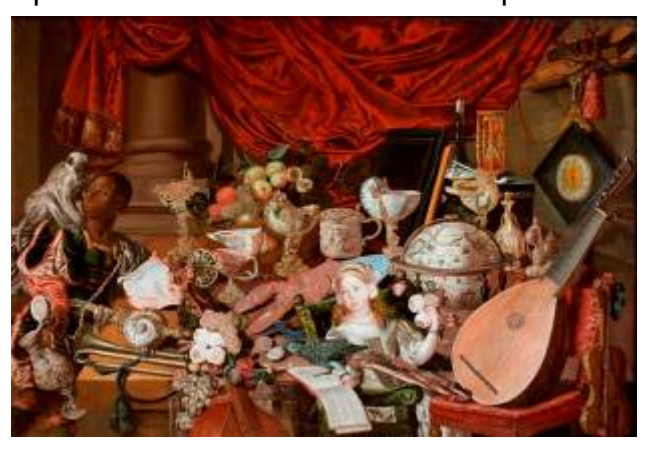
The Paston Treasure, Dutch School, 17<sup>th</sup> Century, Oil on Canvas, Norwich Castle Museum & Art Gallery

CURIOSITY: Art, Wonder and the Pleasures of Knowing, Norwich Castle, Special Exhibition Galleries 28 September 2013 – 5 January 2014