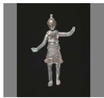
Cast copper alloy statuette of a soldier in Roman military dress, arms outspread

The exhibition will showcase some of the British Museum's finest pieces from the Roman period, with over 130 loaned objects on display. There will also be objects from Norwich's own collection of Romano-British material, setting a local context for visitors.