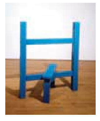
Adam Chodzko, Untitled Stile (teenage version), 1992, Arts Council Collection, Southbank Centre. London.

SHORTCUTS & DIGRESSIONS: Contemporary sculpture from the Arts Council collection, Saturday 11 May—Sunday 8 September 2013