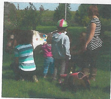
Getting to know the pony

As always the programme did not always go to plan but the different experiences, delays and extended timings all added up to an unforgettable visit.