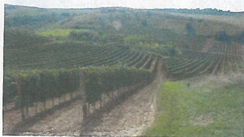
A visit to a vineyard in the Fruška Gora followed by the obligatory wine tasting!

The Director, staff and pupils of the school are very grateful to the Association for its continued support for the various projects it has funded. The value of the 'Riding for the disabled' programme is experienced by many pupils with varying physical and mental disabilities.