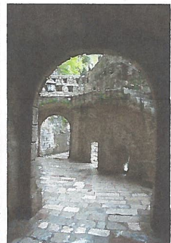
Kotor and mountains