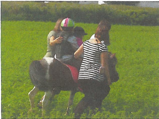
The equipment in use!