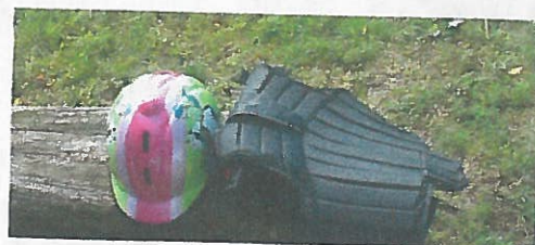
Some of the equipment

The visitors went to see the development of the 'Riding for the Disabled' programme established by the Milan Petrović School and supported by the Association with a grant to purchase equipment.