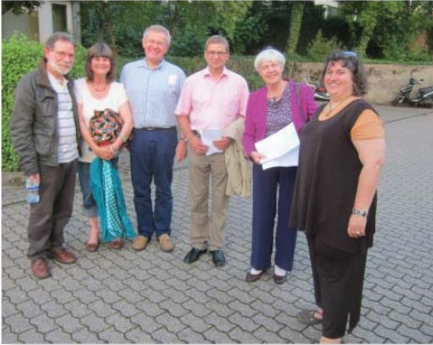
Churches arrive Koblenz