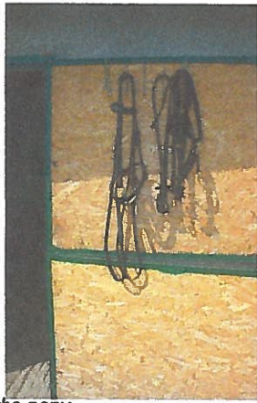
Iack for the pony.