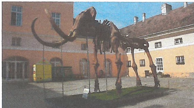
a Mammoth dug out of the local clay.....