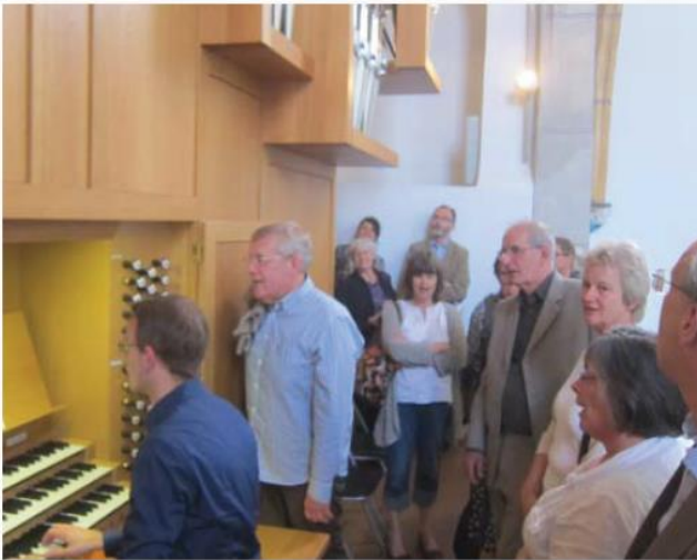
Organ Recital Florinskirche