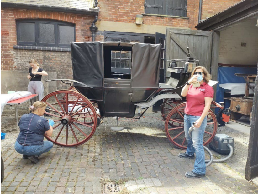
Deep Clean of coach house and Brougham

The majority of members of the Stewarding team have now returned to duties post-pandemic, and the Garden team is up to full strength with their hard work really paying dividends in terms of how the garden looks and visitors very positive reaction.