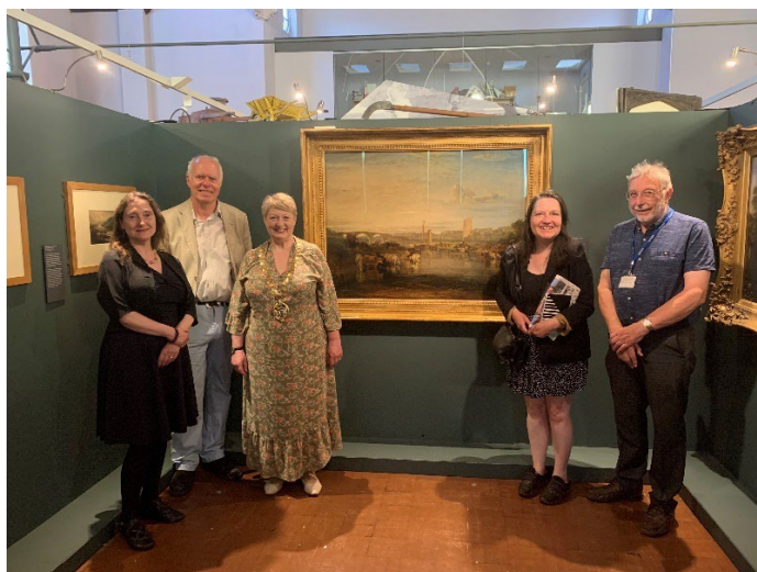
The Mayor of King's Lynn opening the Turner exhibition at Lynn Museum