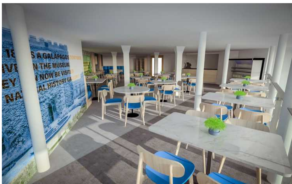
The design concept for the new Restaurant

NMS staff have been working with suppliers to purchase furniture, equipment and crockery for our new restaurant, as well as looking at interior design options.