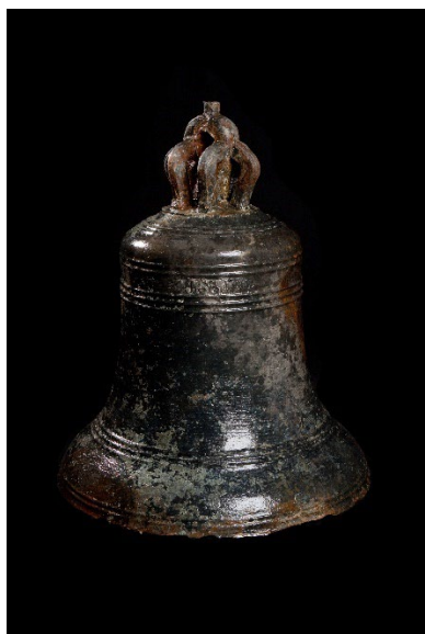
The Gloucester's ship's bell manufactured in 1681

She is also involved in other, longer-term projects, including research for Masquerade , an exhibition on the history and significance of fancy dress, scheduled for 2025/26. In addition, she is working towards a stores re-organisation.