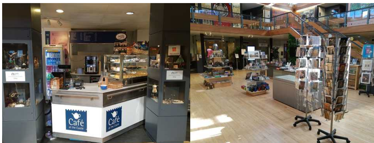
Temporary catering and retail units at Norwich Castle

A 'pop-up' catering offer continues to operate within the Rotunda areas of Norwich Castle along with a seating section. This interim offer will remain in place until the new catering facilities open as part of the Norwich Castle: Gateway to Medieval England project. An enhanced retail offer has now been installed within the Rotunda, with many more lines of stock being made available for purchase.