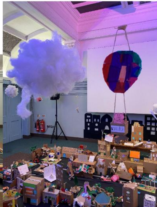
Cityscape assembly in the Town Close Auditorium