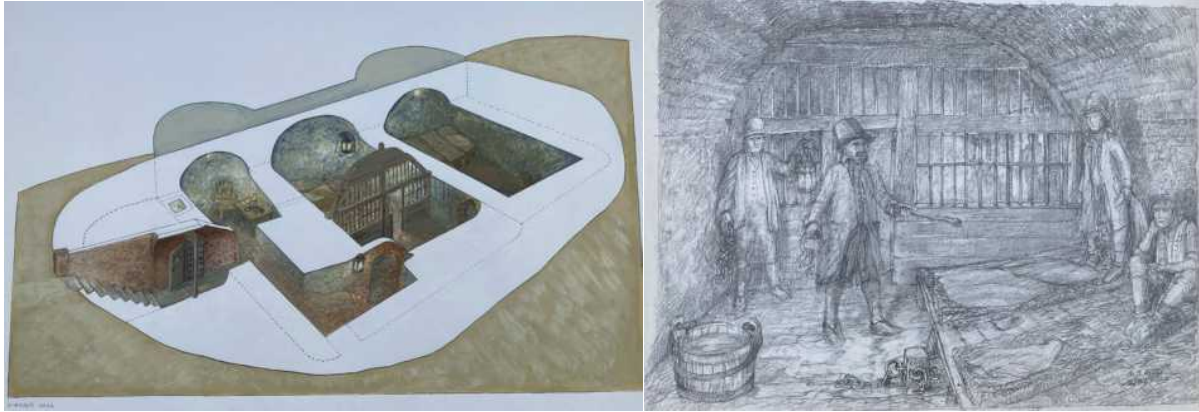
Illustrations showing what the original late 18 th Century dungeon cells would have looked like