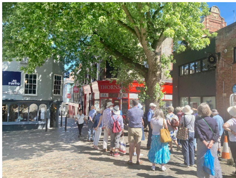
Refugee Week walking tour