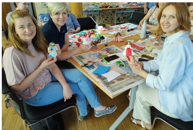
Refugee Week events

own national costumes. 55 participants included people of the following nationalities Iran, Ukraine, Brazil, Palestine, Hong Kong, Poland, Romania, Tajikistan, Guinea Bissau, Hungary, Iraq, Spain, France, Portugal, Bangladesh and Moldova. The skills of the group were exceptional, with the Ukrainian peg dolls that were created particularly beautiful and moving. The dolls will be displayed, alongside the original Polish set, as part of our Centenary celebrations in 2023.