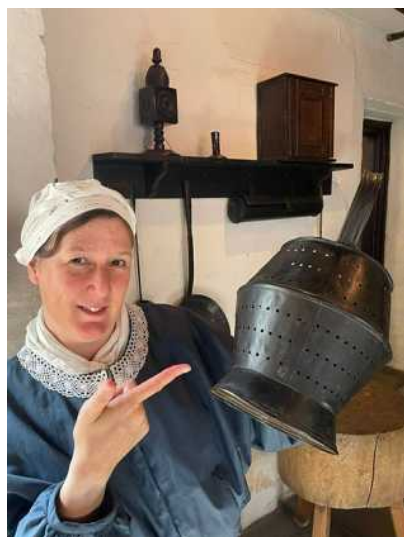
Great Gadgets family activities

This year's summer activity programme entitled Great Gadgets is a collections- based look at some of the more curious household objects that find their way into the museum's collection, with the emphasis on family participation.