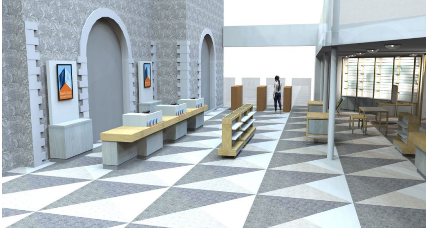
The proposed new entrance and retail areas