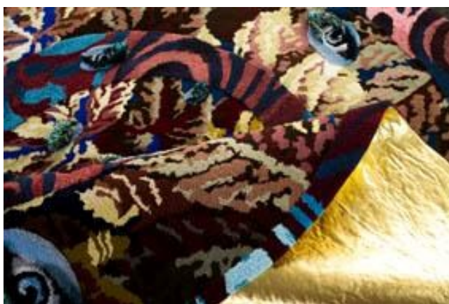
Detail of Diagrams of Love: Marriage of Eyes , 2015

Part of Hayward Touring's comprehensive exhibition programme, designed to showcase and celebrate the country's leading role in the international art scene, The British Art Show is a five-yearly exhibition. For its eighth incarnation 42 established and emerging contemporary artists are represented and the show features more than 100 works – many of which were commissioned or made especially for the exhibition.