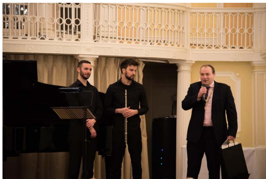
The Lord Mayor speaking at the end of the performance