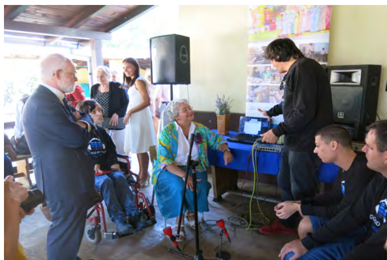
The British Ambassador at the "Milan Petrović" School

On the last day the twinning group was formally welcomed by the President of the Novi Sad Council before meeting up with many Novi Sad friends for a final meal together in the evening.