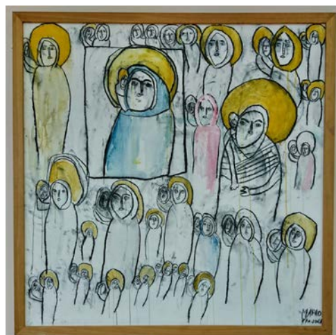
One of the paintings produced at the school

It was an events packed visit which has helped keep strong the enthusiasm of all those involved in the friendship of our two Cities.