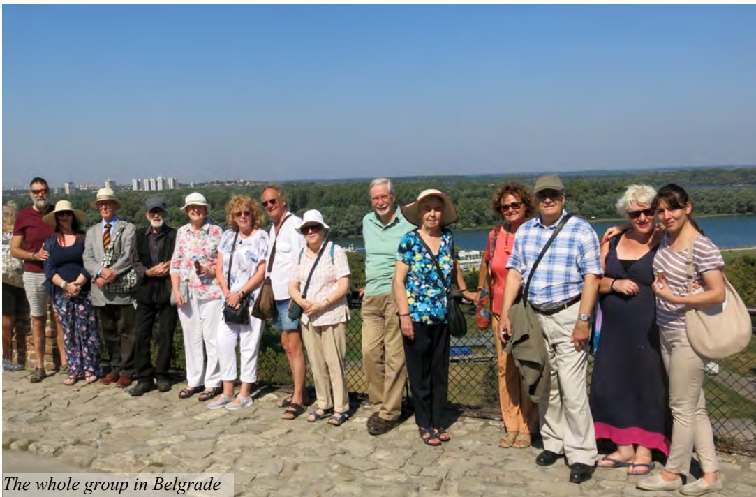
The whole group in Belgrade