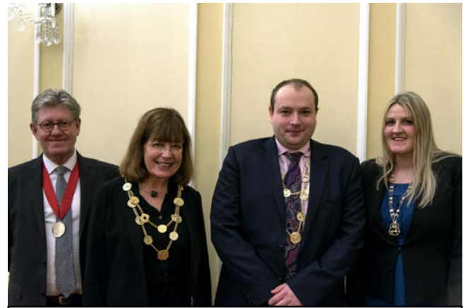
The Sheriff and the Lord Mayor (centre) with their consorts