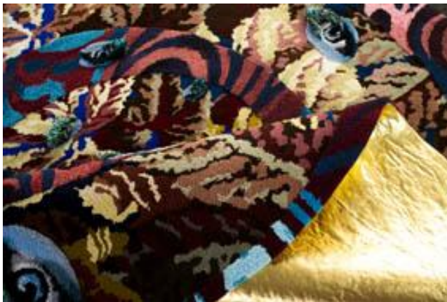
Detail of Diagrams of Love: Marriage of Eyes , 2015 © Linder Sterling/Dovecot Studios Ltd. 2015 Courtesy the artist, Stuart Shave/Modern Art and Dovecot Studios Ltd.

Part of Hayward Touring's comprehensive exhibition programme, designed to showcase and celebrate the country's leading role in the international art scene, The British Art Show is a five-yearly exhibition. For its eighth incarnation 42 established and emerging contemporary artists are represented and the show features more than 100 works – many of which were commissioned or made especially for the exhibition.