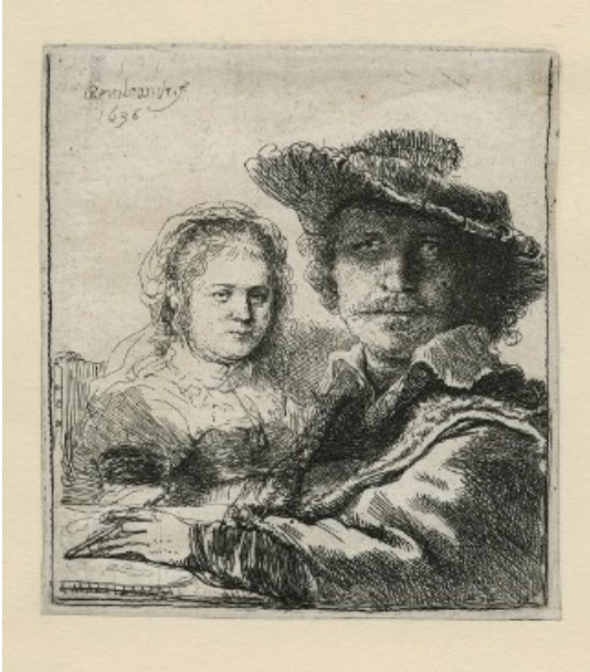
Rembrandt van Rijn Self-portrait with Saskia , c 1636 Etching, Norwich Castle Museum