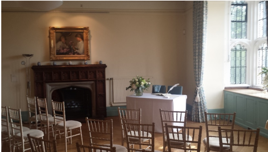
The Benefactors Room dressed for a wedding

been completed within the Benefactors Room. The wedding parties for these ceremonies have culminated in additional visitor numbers at Norwich Castle of 7,661 for the first third of 2016/17.