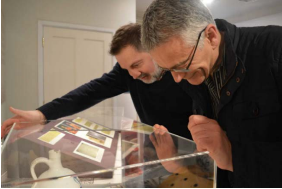
Visitors enjoy the trade tokens display