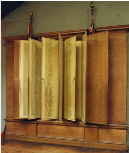
The Roll of Honour

The conservation and relocation project for the Norwich Roll of Honour is ongoing, funded by the Town Close Estates Trust, Geoffrey Watling Trust, Carters and the War Memorials Trust.