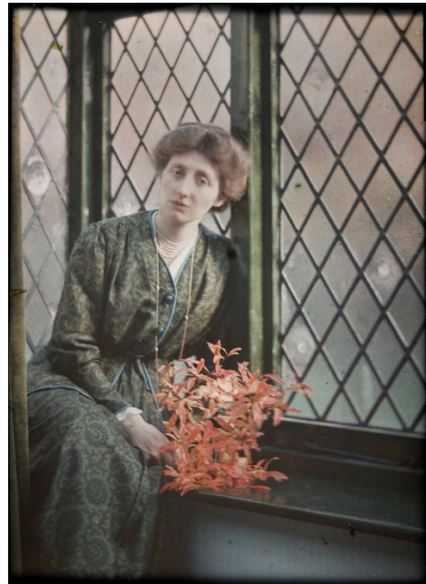
'Belcher' Johnson & autochrome self-portrait images from the NMS Oliver Edis collection