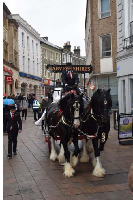
The History Train in Norwich city centre