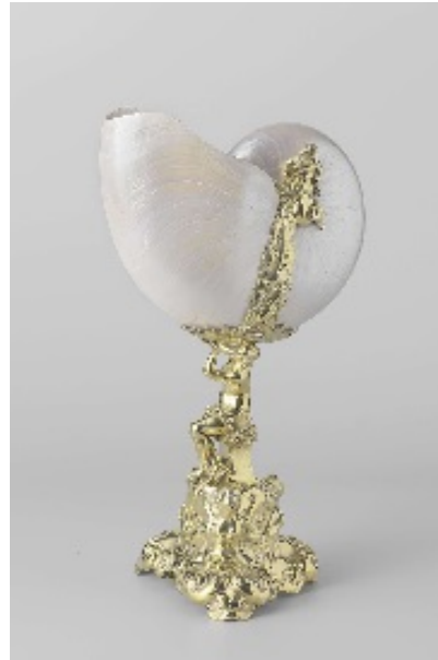
Nautilus shell and silver-gilt cup Holland, c1630 Rijksmuseum, Amsterdam