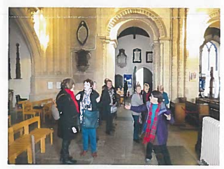
Arriving at Wymondham Abbey

Their visit started in Wymondham with a guided tour and discussion at Wymondham Abbey. After that we made our way to the The lunch party at the Green Dragon. Green Dragon Pub, a 15th century establishment where we had a buffet lunch. It was the back to Norwich for some free time.