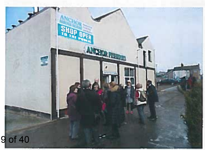
Page 9 of 40

On Thursday the following day we boarded the coach and made our way to Lowestoft. The first 'port' of call was the Anchor Smoke House, where we saw Herring being prepared in readiness to be Kippered in the old tradition way with oak chips in a chimney type smoker.