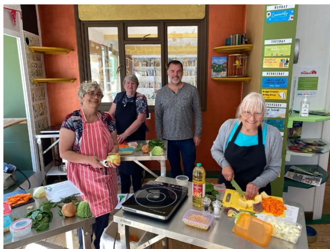
Time together at Shoebox