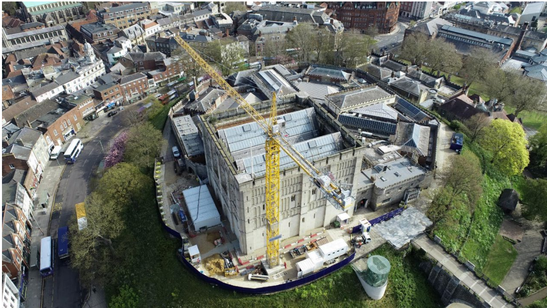
Recent drone image of the construction site

In August 2020 the Keep and surrounding site areas were formally handed over to the Principal Contractor, Morgan Sindall Construction following Contract Award for the main build. Internal and external secure hoardings are in place to demarcate the construction site and delineate the contractor compound on the mound. There is an additional contractor compound and deliveries access point in the Lower Castle Gardens. A tower crane has been installed on the mound. An internal hoarding line runs across the entrance to the Rotunda, separating the construction zone from the areas of the museum that remain open to visitors throughout the project.