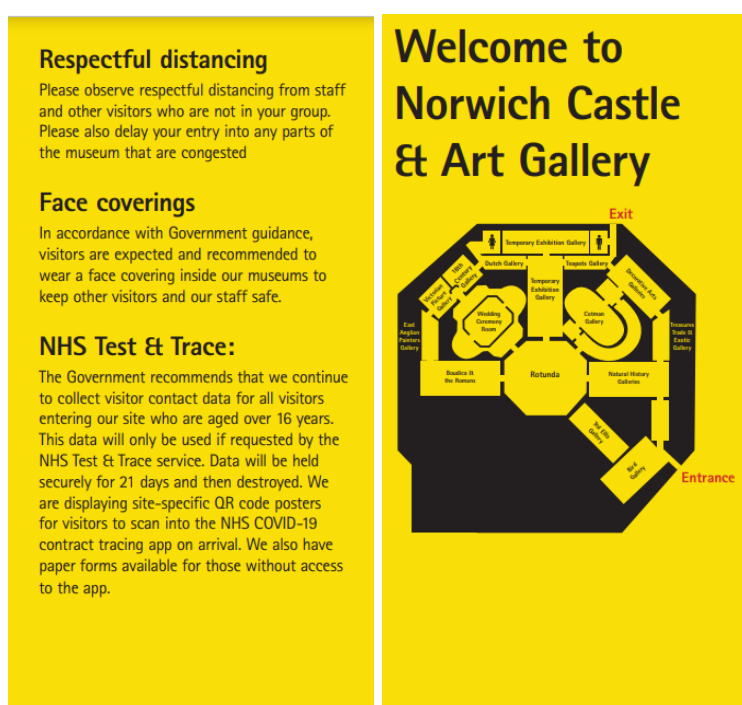
Samples of the COVID signage in use at Norwich Castle

Visitors continue to use the external entrance door E8 as the temporary COVID-19 entrance and entrance route. Visitors requiring level access including those with wheelchairs or pushchairs can enter via entrance door E9. Visitors are also able to access toilets. Visitors and staff are advised to wear a face covering in areas accessible to the public and to adhere to a respectful social distance from other visiting parties.