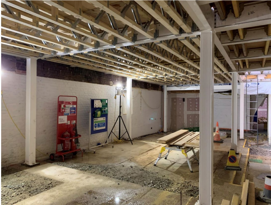
New steelwork and floors in the new WC block area