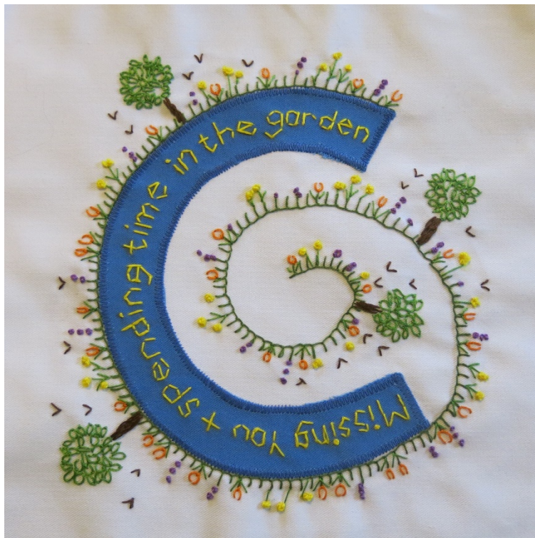
Coronaquilt , 2021, made and donated by the Costume and Textile Association

Another lockdown testimonial textile is the Coronaquilt made by members of the Costume and Textile Association for Norfolk Museums. With 80 squares made by 58 individuals, the quilt documents thoughts and feelings about this life-altering period that we are still living through and captures the early stages of the lockdown with its new terminologies such as 'super-spreaders', the visual icons of rainbows and a deep appreciation for the nation's key-workers.