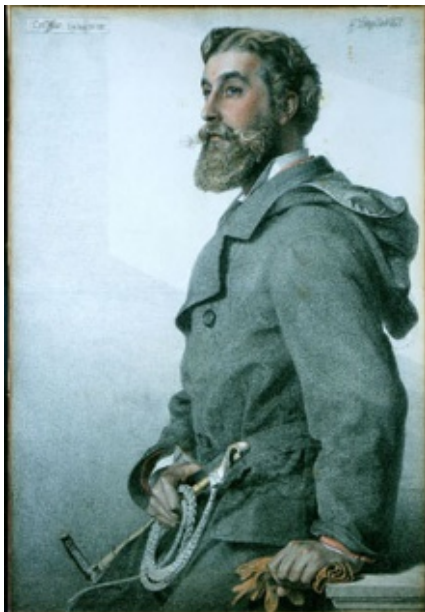
Portrait of Cyril Flower, Lord Battersea , by Frederick Sandys, chalk on paper, 1877