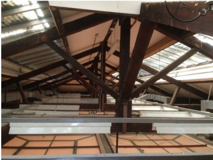
Norwich Union Gallery Roof Space

Works will also include an upgrade of the duct-work and installation of insulation within the gallery roof voids. This will ensure we can efficiently maintain the environment and recirculate a percentage of the conditioned air back into the gallery spaces.