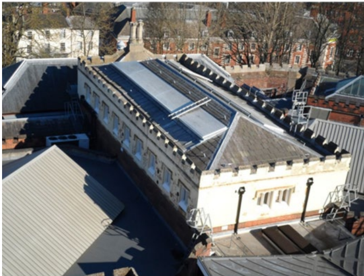
Norwich Union Gallery Roof

Works will take approximately 5 months, with works due to be completed in April 2022.