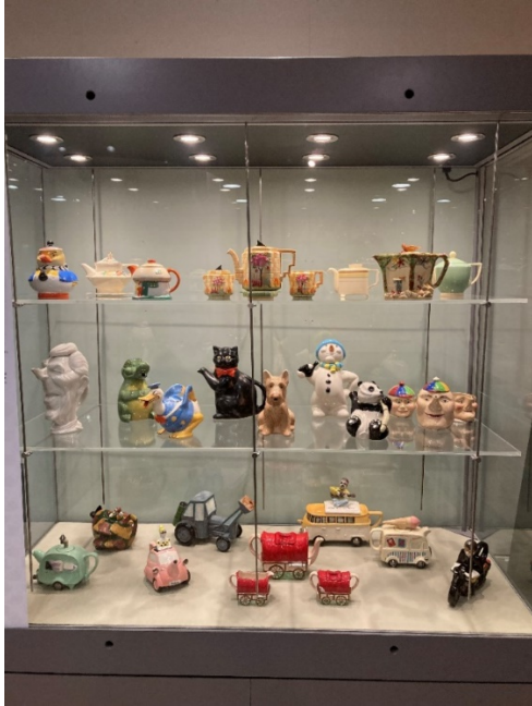
The new teapot display in the Arts of Living gallery