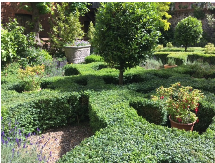
Strangers Hall Knot Garden