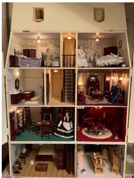
Mr Taylor's Dolls house

The annual collections deep clean is being carried out in January- February 2022 and planning is in place to tackle the increase in mould found in certain stores, which is in part the result of a lack of air circulation during lockdown.