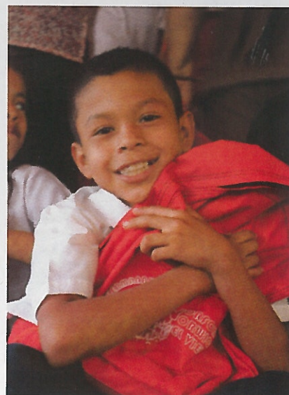
This new entrant to the Scholarship scheme earlier this year was clearly delighted to receive his school bag with exercise books pens and pencils

The 47 graduates will now go on to Secondary education or go into employment. We congratulate them and wish them well for the future. They will be replaced in the new school year starting in February to bring the number of scholarships in the scheme back to 200. The new entrants will be selected by the local Teachers Committee under the terms of the Scholarship project agreement. The main criterion is that the children are selected from the poorest families who could not afford to send their children to school.