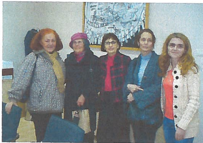
At the Milan Petrović School.