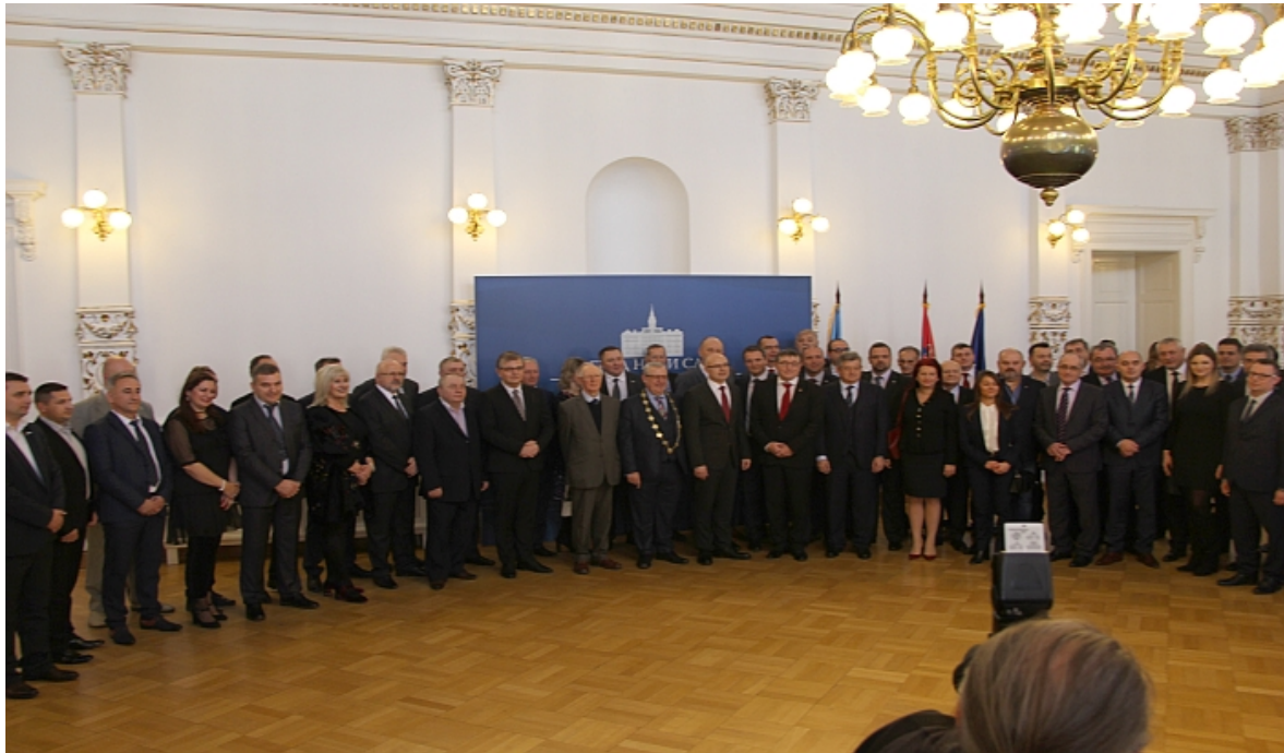
International delegates at City Hall Novi Sad

A crowded programme built into the two short days that Cllr. Waters was able to be in Novi Sad enabled all the above (and more!) to happen.