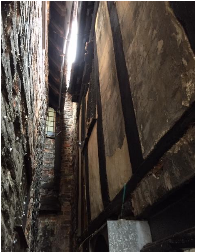
Photo 2 – On right of picture – Timber framed east elevation of the Stranger's Club with the unauthorised extract unit (fire risk) located directly below the C16th timber framed jetty beam. On left of picture - West elevation of 26-28 Elm Hill severely damaged by years of moist fatty flammable emissions in the enclosed gap between the buildings.

This image shows the extremely narrow gap between the buildings and the almost complete enclosure above by the abutting roof eaves. In the event of a deep fat fryer fire starting directly below the extract flue, there is a serious fire risk to both these Grade II* listed buildings and the rest of EIm Hill timber framed terrace.