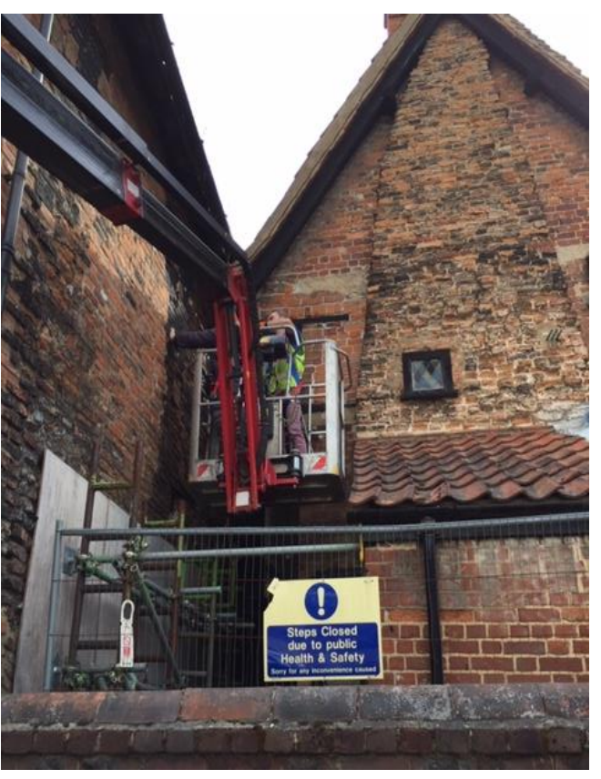
Photo 1 - North elevation (looking from River) of 22-24 Elm Hill (right building) and 26-28 Elm Hill (left building) – showing the extremely narrow gap between the two buildings (into which the flue was unlawfully inserted) and the damaged and structurally compromised west wall of No.26-28.