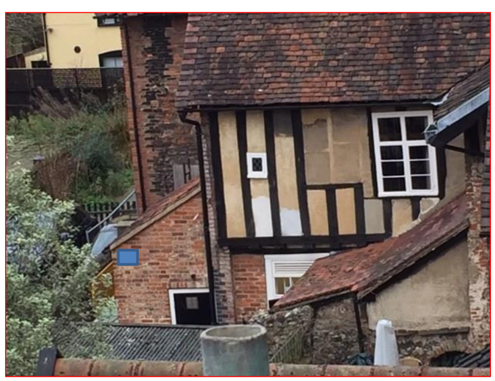
Photo 4 – Showing possible alternative location of flue extract on west elevation the Stranger's Club modern rear lean-to. The NCC could request that the Strangers Club submit such a proposal.

Photo 3 – East elevation of 26-28 Elm Hill – Brickwork has been severely structurally damaged by the moist emissions from the kitchen flue unlawfully installed immediately opposite. Windows of 26-28 Elm Hill are directly above the extract, which makes them unopenable due to the stench of the deep fat fryer fumes. Even with the windows shut, the whole of 26-28 Elm Hill reeks with the fumes from the unlawful extract which permeate through the masonry when the extract is in use. This explains in part why 26-28 Elm Hill has remained untenanted for so many years and has ended up on the Historic England's National Heritage at Risk register, where it will remain whilst it is blighted by such offensive odours, fire risk and damage from the neighbouring flue extract.