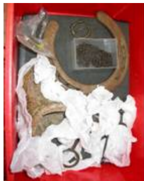
Medieval handling tray- BEFORE