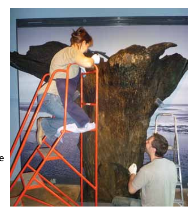
Conservation work in progress on the Seahenge central stump, Lynn Museum.

at Strangers Hall Museum, Gressenhall Farm & Workhouse, Ancient House Museum Thetford, and Cromer Museum. The vulnerability of objects on open display necessitates careful monitoring and maintenance. Work at Strangers Hall in particular has addressed problems of pest infestation and the accumulative effects of annual housekeeping combined with more frequent maintenance