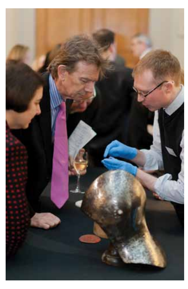
TV presenter Michael Wood examines objects from Norwich Castle at the British Museum event.

Phase 3 In collaboration with partners in southern counties of England and in Calvados in Normandy, to explore and interpret the international context of Norwich Castle's Norman heritage. A partnership, under the name of Norman Connections, has been