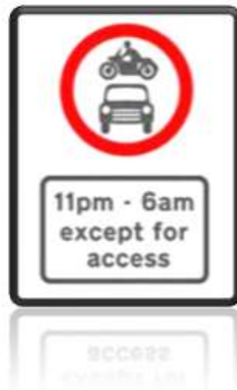
Figure 2: Proposed sign design