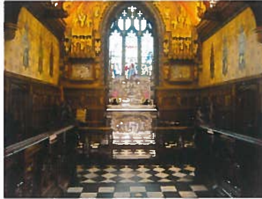
Silver Altar, St Mary's Sandringham

we quickly fanned out, some heading for the impressively large house (originally bought in 1862 for Prince Albert Edward and his wife Princess Alexandra of Denmark who extended it considerably over the years), others to the museum and gardens. It was noticeable that many of the flower beds that used to embellish the wide expanse of grass in front of the house have now been removed leaving only shadows of their past presence. One of guides in the house told us that there are now only seven gardeners for the whole estate.