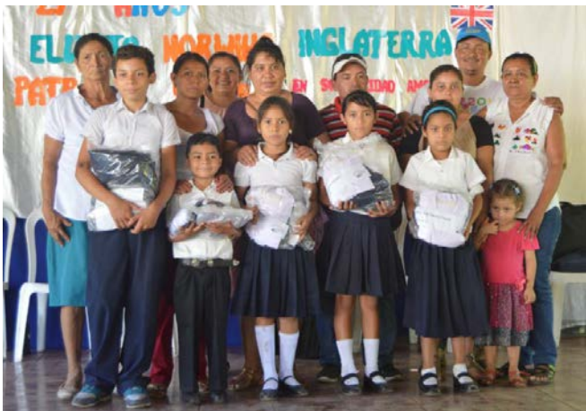
Children with their new uniform packages