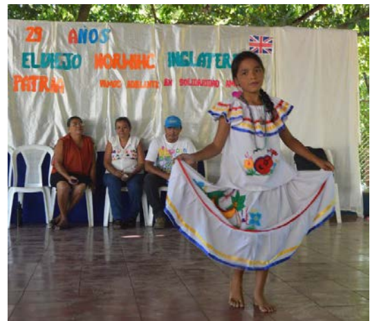
A pupil performs a local folk dance