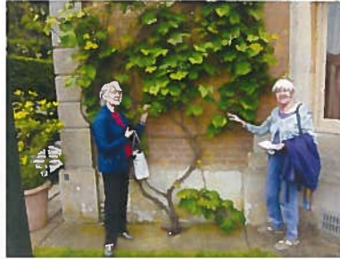
Grape Vines at Sandringham