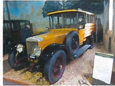
Old Estate Car, Sandringham

Entry to the house was speedy and efficiently managed. The guides (one in each room) were smartly uniformed (dark grey with red edgings) and exceptionally well informed, keeping us all fully briefed about what we were seeing and diligent in answering any questions that we might have. Although in many ways like other stately homes the fact that it is a Royal Residence, and one regularly used by the Queen and her family, gave it an extra patina of interest: the more so because the guides were able to tell us how the main living room was used at Christmas, with the family gathered round the large wood fire watching TV like the rest of us, and how the Prince of Wales used the library for his private meetings.