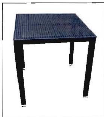
Bacchus Table Ref: W837T H760mm x W700mm x D700mm Supplier: Wannys Furniture Tel: 01953 499 949