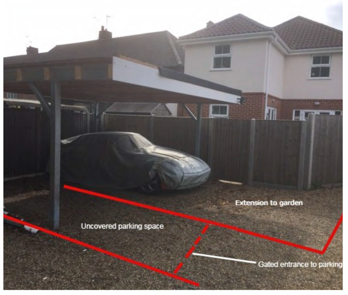
Figure 2- Proposed alteration to property

4.1 The applicant is proposing the demolition of a carport for 1 covered parking space to extend the property's garden. 1 parking space will be retained for future amenity. It must be noted that right of way for the adjoining properties won't be impeded.