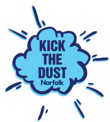
The new project logo being used on social media accounts

"This project will create a model that will facilitate sustained engagement with the young people of Norfolk, including those most hard to reach. NMS will work with YMCA Norfolk and Creative Collisions, two organisations with a strong record of engaging the most vulnerable young people. Young people will create an individual journey into active engagement with Norfolk's heritage, using structured progression pathways based around a menu of options, tailored to meet individual needs. Specialise mentoring and the support of NMS will ensure young people reach their potential and achieve their aspirations. Outcomes for young people will include certificated skills and training, enhanced employment opportunities, active involvement in programming and a chance to shape the direction and governance of heritage organisations."