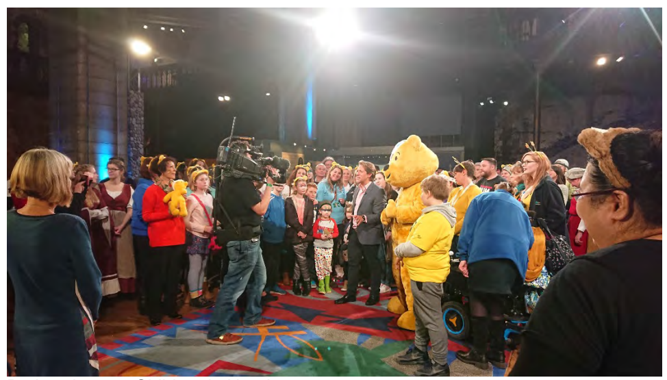
Pudsey bear at Children in Need

November saw another successful fireworks display from the Castle for Norwich City Council's Big Boom fireworks, which was very well attended again this year, drawing crowds across the city. November also saw one of the most challenging venue hire events of 2018, with the site hosting the BBC Eastern region's live coverage for Children in Need . Whilst this was a substantial undertaking with regards to set-up along with the complexities of hosting live camera crews, the evening was a great success. The event provided a fabulous evening of entertainment for families, local charities and fundraisers as well as great coverage for the Castle across the region.