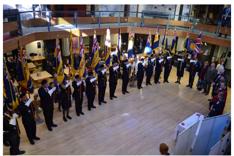
Royal British Legion event on 21st October