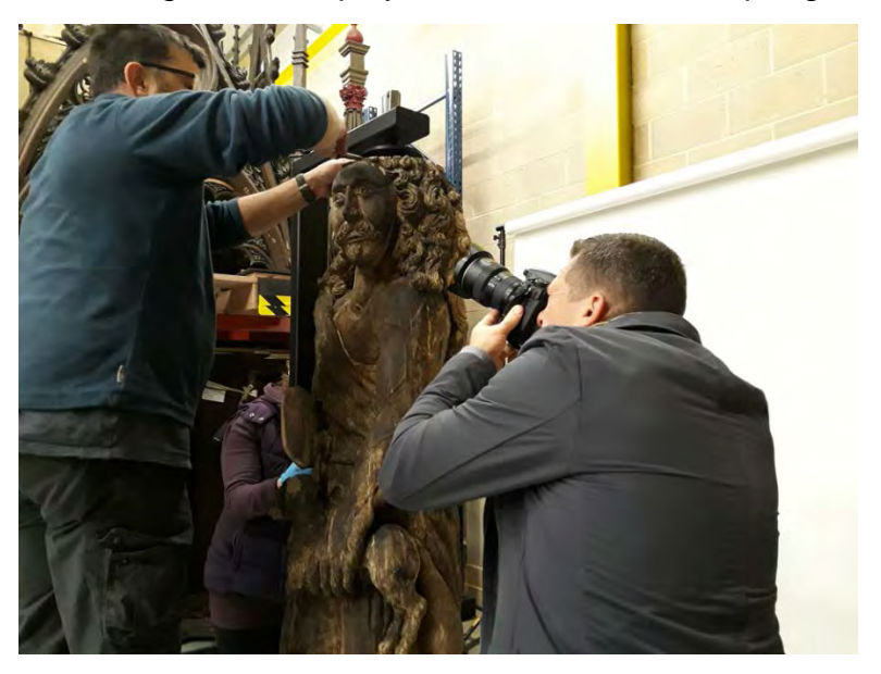
Samson in store being photographed.

Samson was recently removed from his current temporary resting place at the Collections Centre at Gressenhall for photography, and assessment by the NMS Design and Technical Team. A specialist mount maker from conservators Plowden & Smith was on hand to demonstrate how Samson will be mounted when he goes on display at the museum next spring.