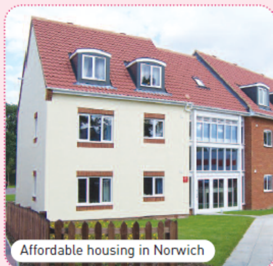
Affordable housing in Norwich

Allocations will be made to ensure at least 36,820 new homes can be delivered between 2008 and 2026, of which approximately 33,000 will be within the Norwich Policy Area (NPA – defined in Appendix 4), distributed in accordance with the Policies for places.