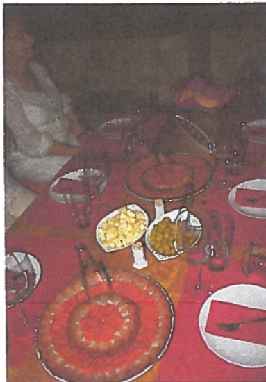
A 'small snack' at the vineyard during the wine tasting.....