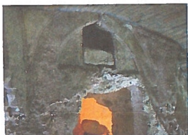
Remains of a Turkish bath from the Ottoman period at Stari Slankamen

A long anticipated visit to Stari Slankamen proved to be one of the 'highlights' of the visit. An interesting topographical region on the edge of the Fruška Gora. Evidence of Roman and Ottoman occupation through dramatic remains proved to be of great interest while the visit to two vineyards and a local salaš for lunch proved to be a great gastronomic event.