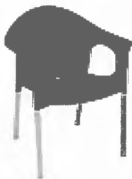
Black Bolero stacking armchair aluminium/plastic