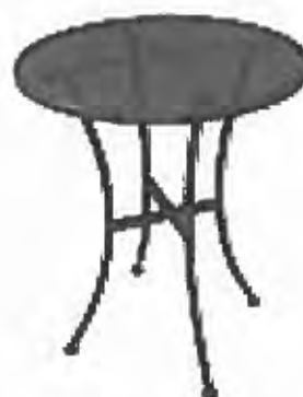
Round black steel Bolero table 600 mm