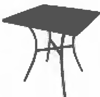
Square black steel Bolero table 700 mm