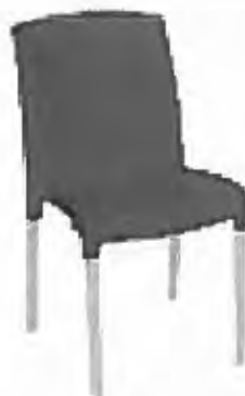
Black Bolero stacking side chair aluminium/plastic