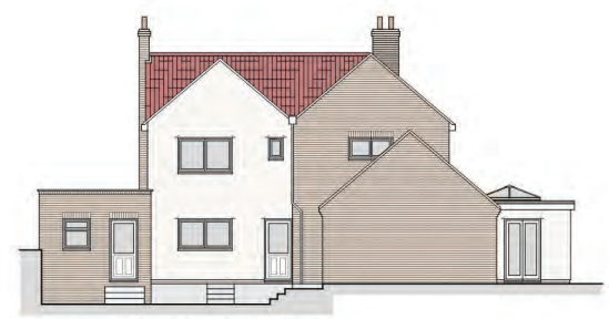
Proposed Rear Elevation 1:100 @ A1