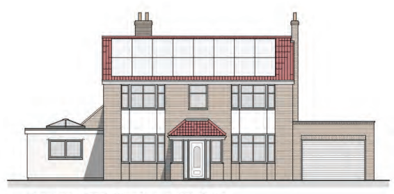
Proposed Front Elevation 1:100 @ A1