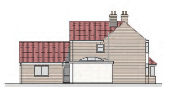
Proposed Side Elevation 1:100 @ A1