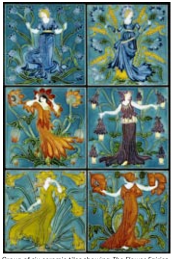
Group of six ceramic tiles showing The Flower Fairies , designed by Walter Crane, possibly for Pilkington & Co. Ltd, England c.1900.