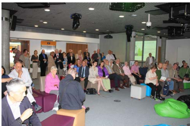
Some of the audience at the launch of the audio/visual presentation on 10 th August.