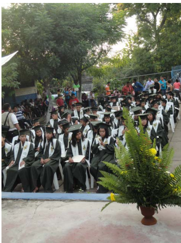
Another picture of one of the graduation ceremonies in December 2011.

The school year finishes in November when the academic results are announced for each pupil. If they score 70% or better overall they can progress to the next grade. In the case of success in Grade 6 the pupils graduate from primary education and are eligible to go on to secondary education.