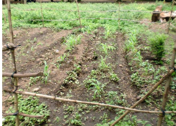
Part of the school garden at the Amigas de Holanda School

One school that does not have sufficient land to set up a garden showed a particular initiative by recycling old vehicle tyres to establish a nursery of medicinal plants, shown in the photograph