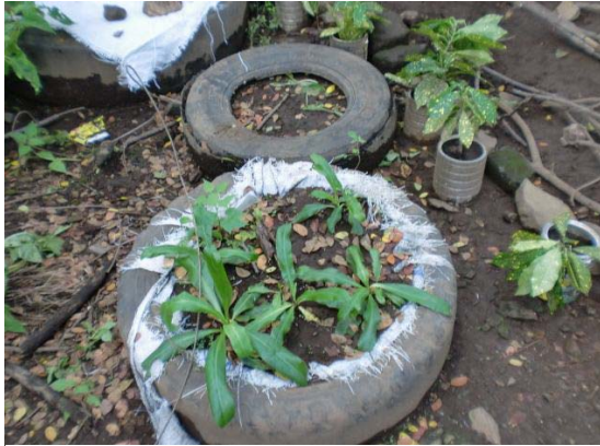
Part of the medicinal plant nursery at the El Perpetuo school.