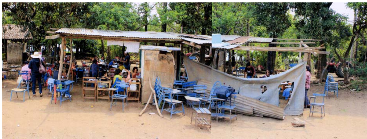
The Temporary school at Campirano Norte.

The children were being taught in a shack, which gave no protection from the wind and rain. We visited the site and compared it with another similar school, but agreed that the one at Campirano Norte was the most urgent. The Mayor agreed to cover the balance of the costs, which initially were estimated at a total of over $5,000. The building of the school was due to be finished by March 2012. A budget for the construction was sent to us by the council and