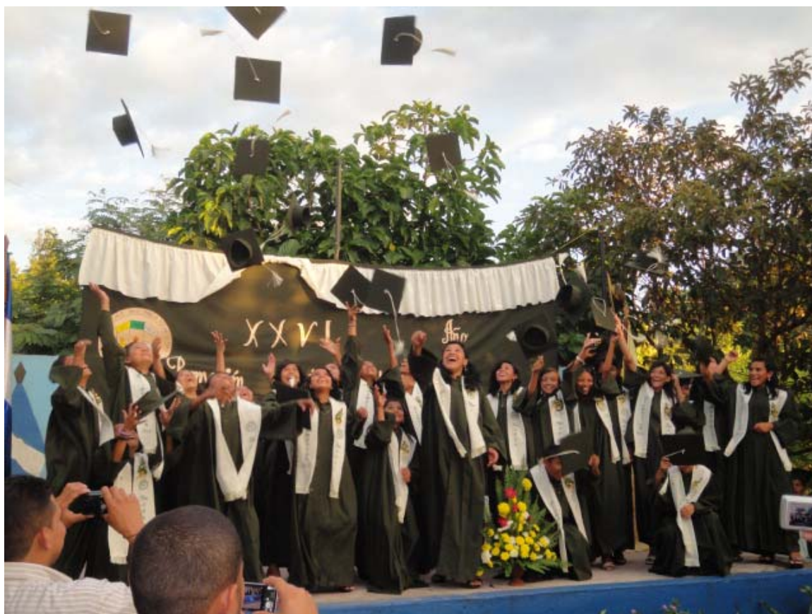
Some of the 57 scholarship project pupils who graduated from 6 th grade in November 2011 celebrate their success