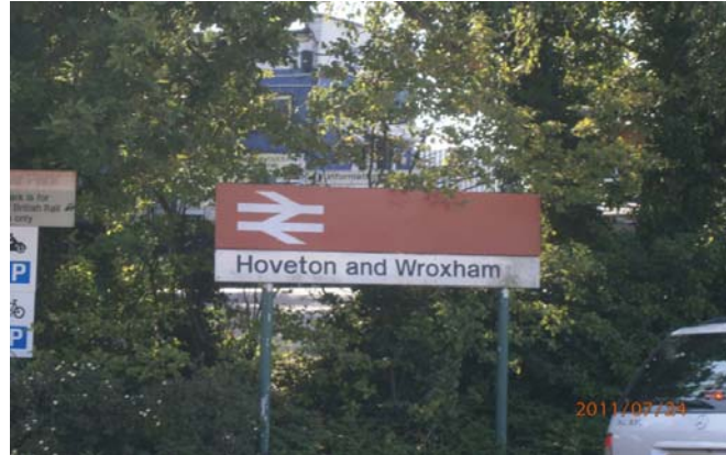
The station sign at Hoveton The last stop before heading home

But we didn't forget our purpose. We managed to raise £856.50 for the Norfolk and Norwich-El Viejo Friendship Link. Let's hope we can raise even more in 2012!