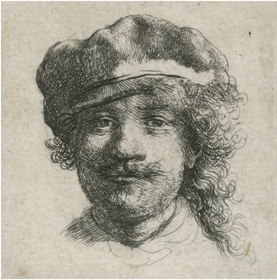
Rembrandt van Rijn, Self-portrait c 1634. Etching, Norwich Castle Museum

The current major exhibition at Norwich Castle showcases the extraordinary NMS collection of 93 prints and one drawing by Rembrandt, alongside national loans from the British Museum, National Galleries of Scotland, National Gallery and the Royal Collection. Rembrandt's preoccupation with light and shade is seen throughout his work and this exhibition reveals how Rembrandt created unsurpassed effects of light and darkness. An illustrated catalogue has been produced to accompany this important show.