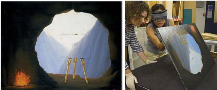
La Condition Humaine by Rene Magritte

The current exhibition in the Colman Project Space until 1 July 2018 is Magritte: The Lost Painting . This explores the story of the detective work recently undertaken on NMS' Magritte painting La Condition Humaine , where a quarter of a missing Magritte painting, La Pose Enchantée was discovered underneath the later work.