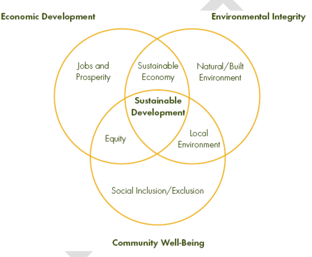
Figure 1: Sustainable development factors and influences

The diagram below shows how sustainable development is achieved. Sustainable development can only exist via the inclusion of economic, social and environmental spheres of influence.