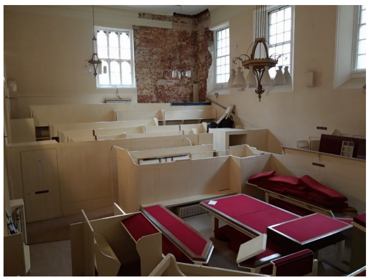
The SW corner of the Courtroom where the dry rot is prevalent

timbers along with the introduction of steel interventions, to reduce the risk of future outbreaks. Once works start, they will take approximately 6 months to complete.