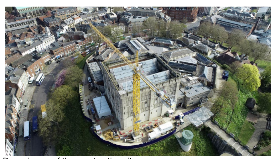
Drone image of the construction site

In August 2020 the Keep and surrounding site areas were formally handed over to the Principal Contractor, Morgan Sindall Construction following Contract Award for the main build. Internal and external secure hoardings are in place to demarcate the construction site and delineate the contractor compound on the mound. There is an additional contractor compound and deliveries access point in the Lower Castle Gardens. A tower crane has been installed on the mound. An internal hoarding line runs across the entrance to the Rotunda, separating the construction zone from the areas of the museum that remain open to visitors throughout the project.