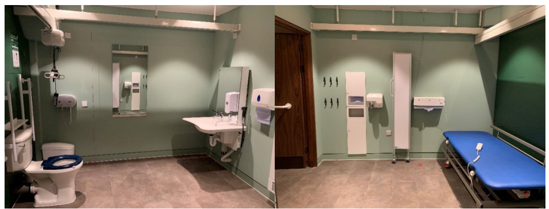
New Changing Place

Installation of structural steels has been completed in the new entrance area and adjoining Percival wing of the building. The next key phases will be the installation of the new glazed atrium roof in the entrance area.