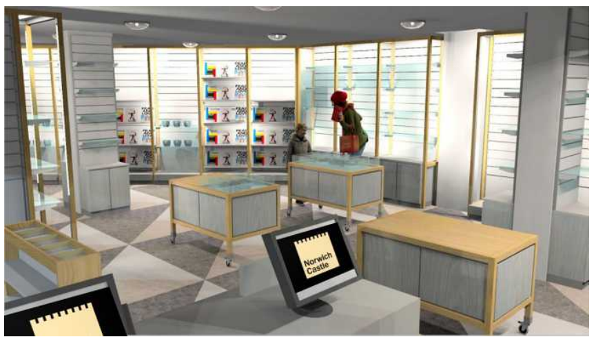
An illustration of the new Retail shop at Norwich Castle