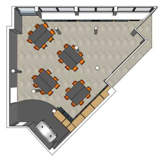
A plan of the new Education Activity Room at Norwich Castle