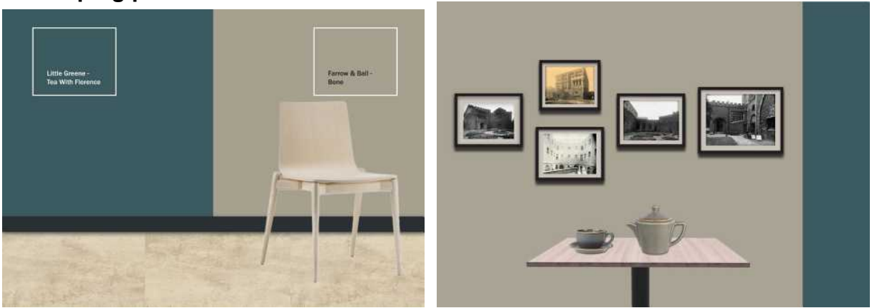
Examples of the décor for the new Castle Restaurant

Developing plans for new facilities at the Castle