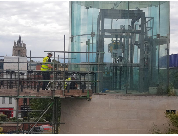
The replacement glazing panel being fixed into place

The work to replace the broken glazing on the external lift was completed in July. The new glass panel was lifted into place with the aid of the tower crane located on the Castle mound.