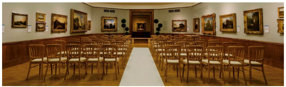
The Colman Gallery wedding space