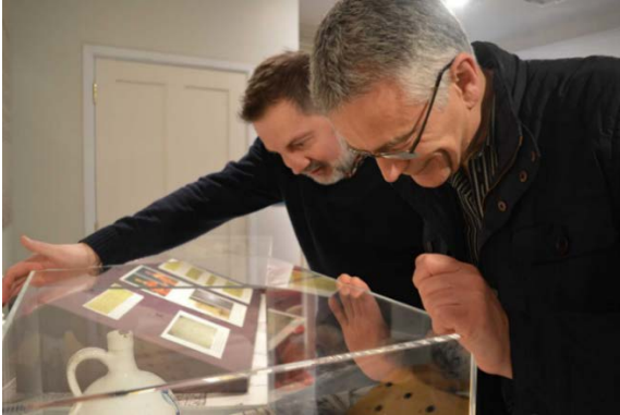
Visitors enjoy the trade tokens display