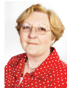
Brenda Arthur Leader of Norwich City Council

expectations because of the funding cuts we face, we will continue to fight strenuously for a better quality of life for the people of Norwich.