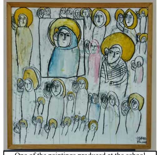
One of the paintings produced at the school

It was an events packed visit which has helped keep strong the enthusiasm of all those involved in the friendship of our two Cities.