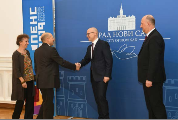
The official presentation of gifts to the Mayor of Novi Sad, Miloš Vučević and the President of the Assembly, Zdravko Jelušić