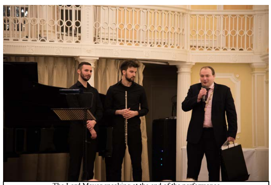
The Lord Mayor speaking at the end of the performance