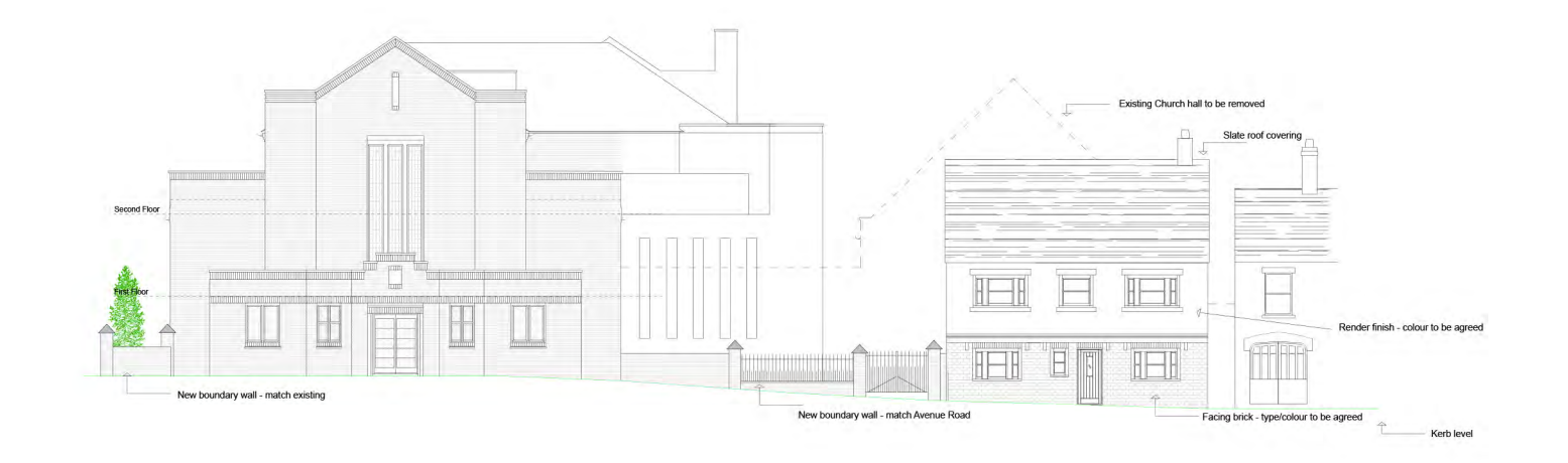
New Street Scene from Park Lane