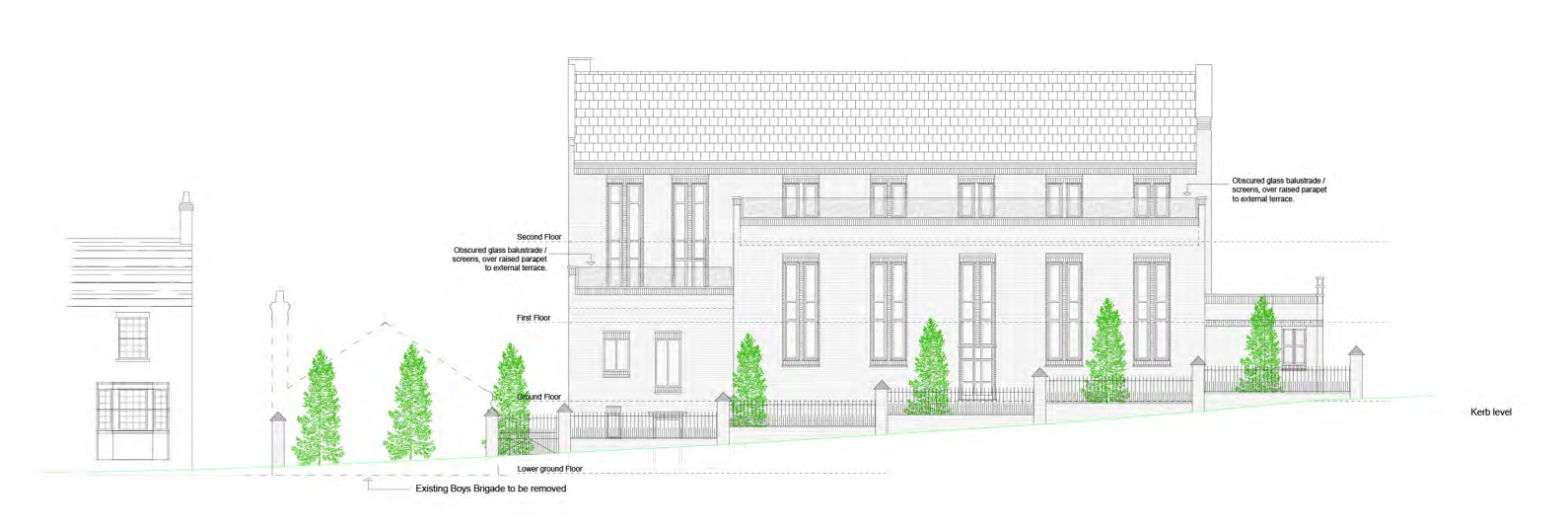
New Street Scene from Avenue Road