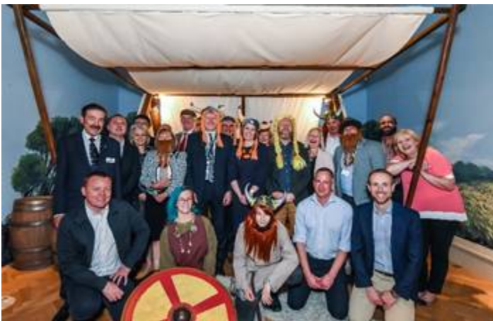
YMCA CEO event hosted by young people on Kick the Dust

In April and May, YMCA activities in Norwich have been focused on all things Viking. An established group came to Norwich Castle Museum for a ' Viking Invasion ' day and were given an in-depth tour of the Viking exhibition as well as taking part in seafaring activities and making some Viking inspired metal art. The group developed their own tours of the Viking Exhibition, supported by the Learning Team, based around their favourite Viking artefacts and featuring costumed character and Viking story telling. They delivered these tours at a special event on 5 May where YMCA CEO's from across the UK attended their annual conference at Norwich Castle. To see the young people make such progress and gain in confidence is both inspiring and motivating, and shows that the approach we are taking is the right one.