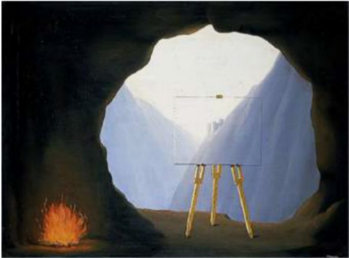
La Condition Humaine by Rene Magritte © NMS

The current extended exhibition in the Colman Project Space is Magritte: The Lost Painting . This explores the story of the detective work recently undertaken on NMS' Magritte painting La Condition Humaine , where a quarter of a missing Magritte painting, La Pose Enchantée was discovered underneath the later work.