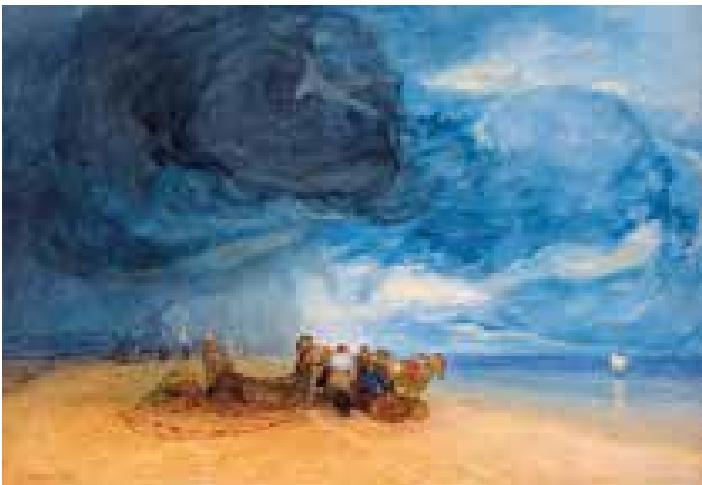
John Sell Cotman, Storm on Yarmouth Beach 1831, watercolour on paper

A chance for visitors to explore the last two decades of Cotman's life through iconic late watercolours and rarely seen drawings.