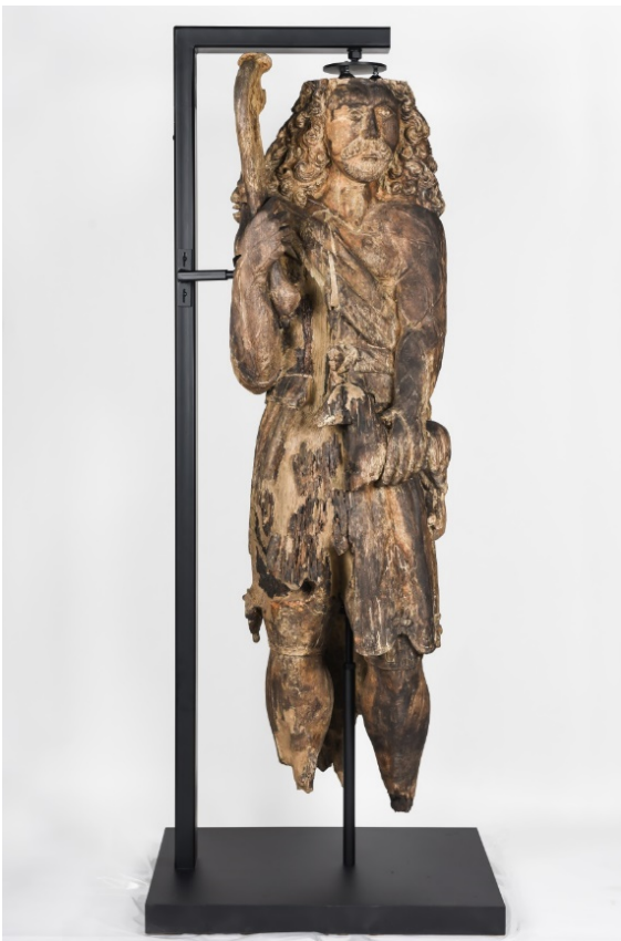
Samson secured on his bespoke mount

Conservators removed over sixty layers of lead paint, consolidated the rotten central core, and constructed a bespoke mount.