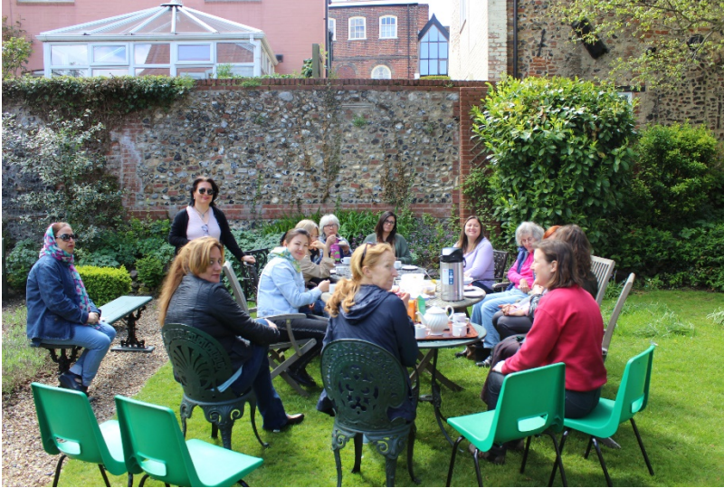
English + Museum tea party in Strangers Hall garden