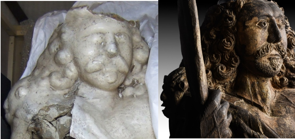
Samson's face and upper body before and after conservation.