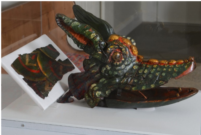
Snap at the Museum of Norwich

Snap's story was the subject of an under 16's writing competition, supported by the National Centre for Writing.