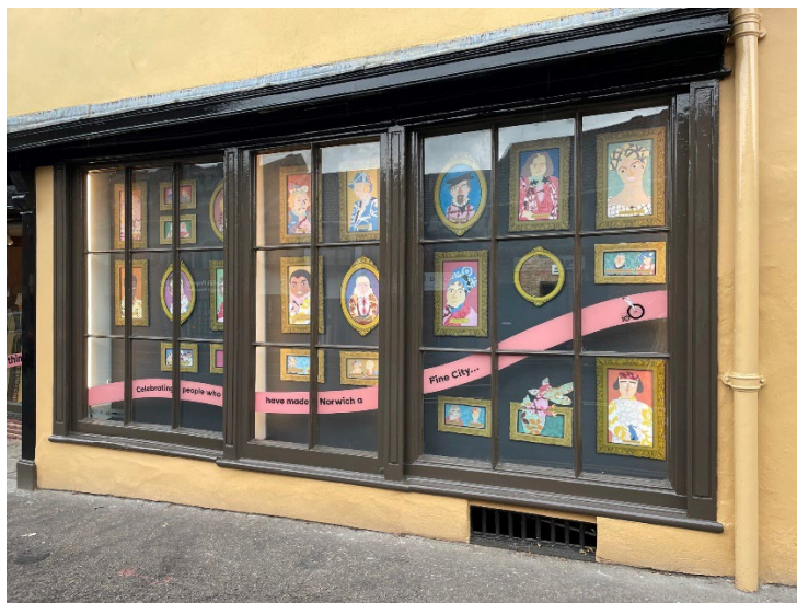
New window displays at Strangers' Hall