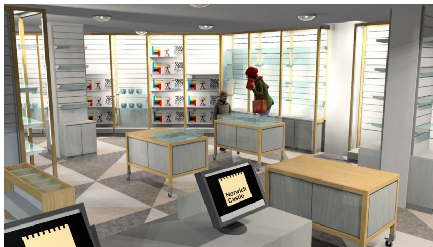
An illustration of the new Retail shop at Norwich Castle