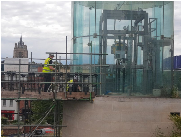
The replacement glazing panel being fixed into place

The work to replace the broken glazing on the external lift was completed in July. The new glass panel was lifted into place with the aid of the tower crane located on the Castle mound.