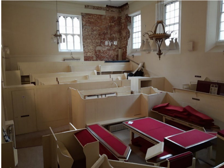
The SW corner of the Courtroom where the dry rot is prevalent

timbers along with the introduction of steel interventions, to reduce the risk of future outbreaks. Once works start, they will take approximately 6 months to complete.