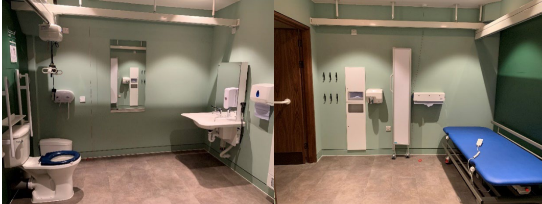
New Changing Place

Installation of structural steels has been completed in the new entrance area and adjoining Percival wing of the building. The next key phases will be the installation of the new glazed atrium roof in the entrance area.