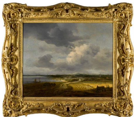
Panoramic Landscape with Cornfields and Dunes Beside the Sea , now on display in the Cotman Galleries in the Castle