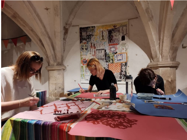
Young people creating a front window collage portrait