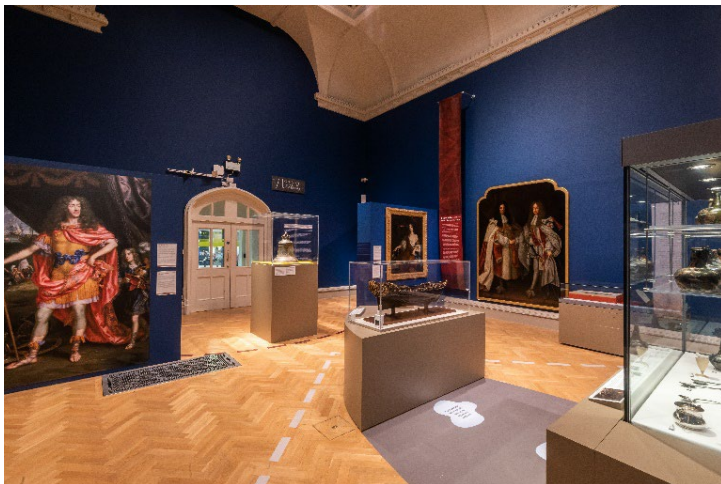
The Last Voyage of the Gloucester exhibition, Norwich Castle