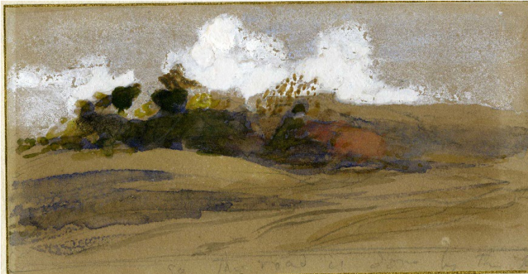
A Road past a Farm , undated, Samuel Palmer (1805-1881)