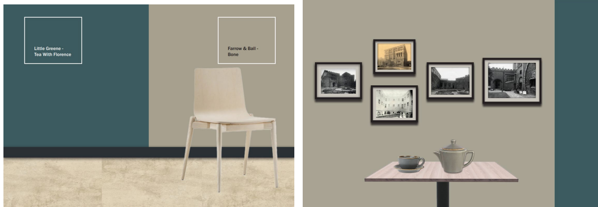
Examples of the décor for the new Castle Restaurant